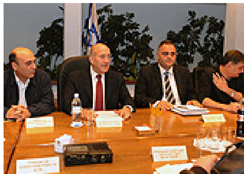
Cabinet meeting (Israeli Government Press Office, January 17, 2009)