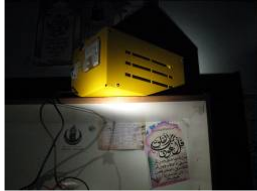
Communications position exposed by IDF forces in the Gaza Strip.