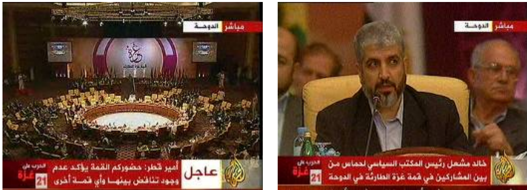
The conference in Doha. Right: Khaled Mashal speaking at the conference.