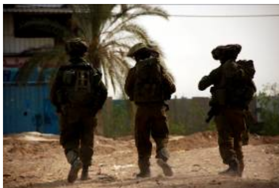
The IDF in action in the Gaza Strip, January 17 (IDF Spokesman, January 17, 2009).