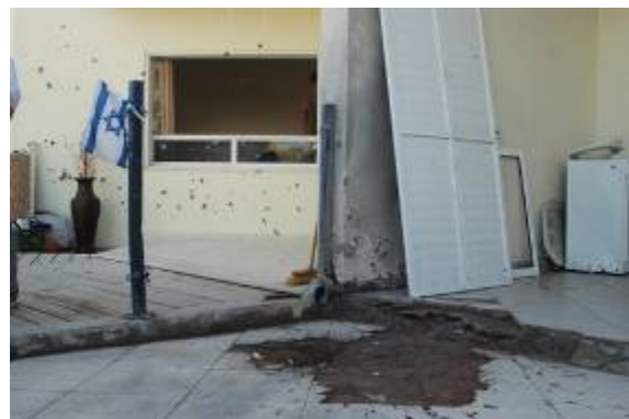
Rocket hit in Sderot ( www.sderotmedia.com , January 16, 2009).