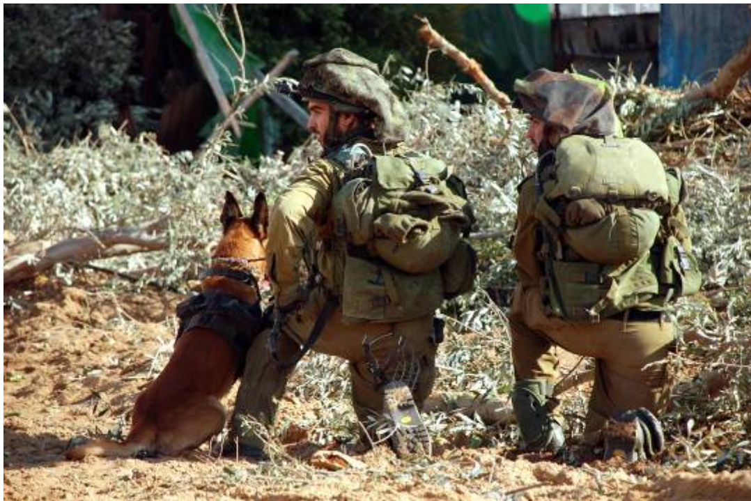
IDF soldiers in action in the Gaza Strip (IDF Spokesman, January 13, 2009).