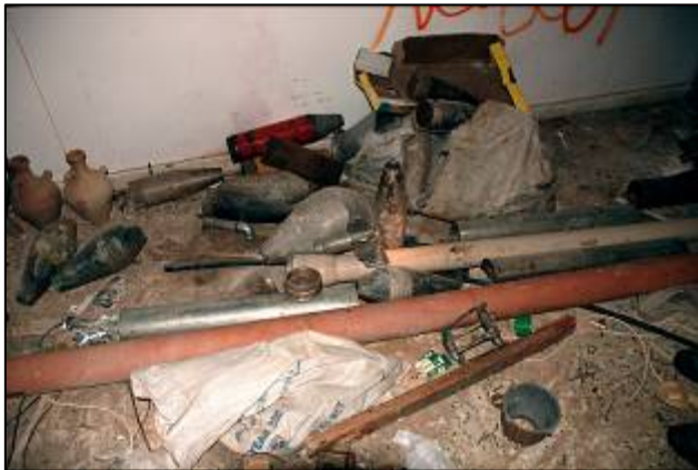
Weapons found in a mosque. Above: An anti-tank missile launcher (IDF Spokesman, January 13, 2009).

■ During the ground operation in the Shati refugee camp on January 13, a mosque was discovered with large quantities of weapons, including an anti-tank missile launcher.