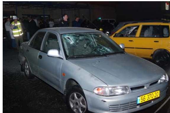
Rocket hit in a Sderot commercial area (Hamutal Ben-Shitrit for www.sderotmedia.co.il , December 18, 2008)

3. In response the IDF attacked terrorist targets four times on December 17. The attacks targeted squads of rocket launchers preparing to fire. In addition, during the night of December 17, Israeli Air Force planes and helicopters attacked two targets inside the Gaza Strip for the first time since the lull arrangement went into effect: a weapons store in the Jabaliya refugee camp in the northern Gaza Strip and a workshop for manufacturing weapons in the city of Khan Yunis , in the southern Gaza strip (IDF Spokesman, December 18). The attack on Jabaliya killed PFLP operative Salah Abu Akel and wounded two. The structure attacked in Khan Yunis was completely destroyed (Iran's Fars website, December 18). In the early afternoon on December 18, the IAF again attacked two rocket launchers near the Jabaliya refugee camp.