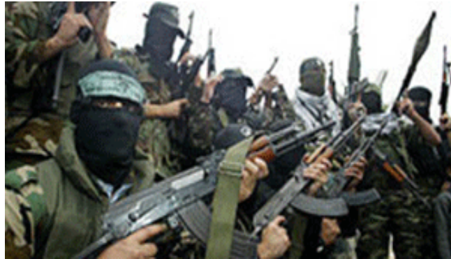
Preparing for the escalation (Izz al-Din al-Qassam Brigades website, December 18, 2008)

5. As they announce the end of the lull arrangement, the terrorist organizations are apprehensive lest the IDF launch an extensive response to their aggression, "Palestinian security sources" told an Al-Quds Al-Arabi correspondent that the Palestinian organizations in the Gaza Strip had established a joint operations room , which included the military wings of Hamas, the PIJ, Fatah, the Popular Resistance Committees and other organizations (Al-Quds Al-Arabi, December 17).