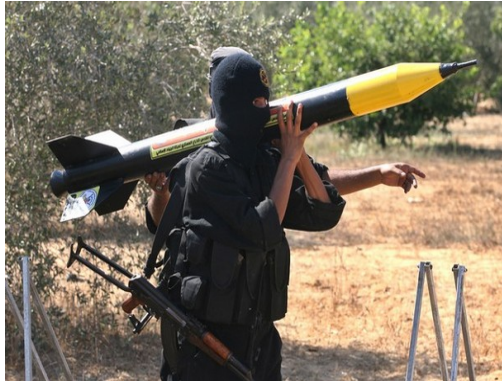
Preparing to fire a rocket (Paltoday website, December 18, 2008)

4. The current escalation is a continuation of the series of events which began on November 4 with the prevention of an abduction attack and led to a significant erosion of the lull arrangement. In the past month and a half (as of the pre-dawn hours of December 18), 213 rockets and 126 mortar shells have been fired by the Palestinian terrorist organizations into Israel, accompanied by other kinds of attacks, including abductions, IEDs, and sniper fire. Beginning November 4, the lull arrangement has been eroded by the terrorist organizations to the point at which it exists only on paper.