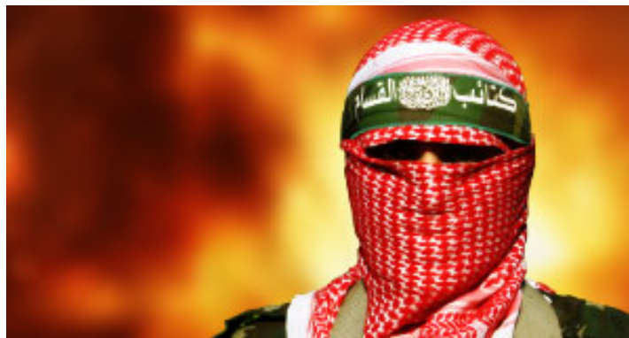
Abu Ubeida: The lull arrangement will not be renewed (Izz al-Din al-Qassam Brigades website, December 17)

6. In the early afternoon of December 17, Izz al-Din al-Qassam Brigades spokesman Abu Ubeida said that the lull arrangement would officially end on December 19, 2008, at 0600 hours [i.e., six months after it went into effect]. He added that it would not be renewed with the same conditions and accused Israel ["the occupation"] of responsibility for Hamas's position. (He said that "...we cannot extend the lull while the Palestinian people are under siege," adding that so far the Egyptian mediator had not spoken with Hamas about new terms or on a new arrangement (Radio Sawt al-Aqsa, December 17).