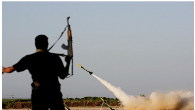
Firing a rocket at Sderot