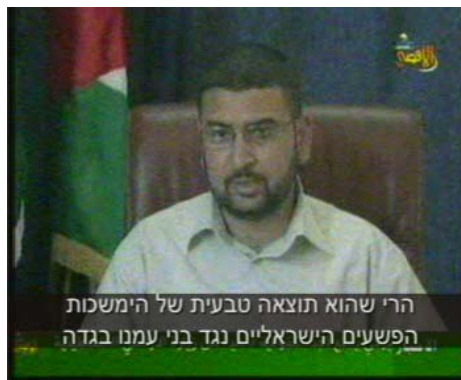
Sami Abu Zuhri, (Al-Aqsa TV, July 2).

i) Hamas spokesman Sami Abu Zuhri said that if the event was in fact an attack, it should be seen as “a natural result” of Israel’s actions against the Palestinians in the West Bank