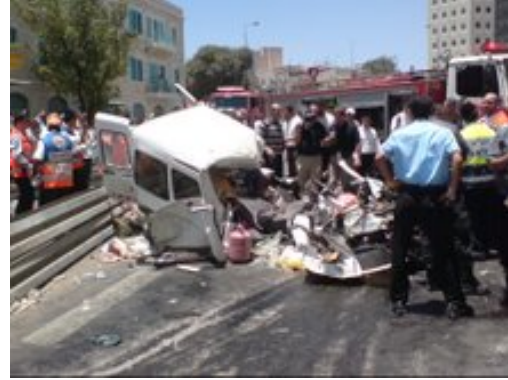
Cars crushed in the attack (Israeli Foreign Ministry, July 2).

5. The terrorist attack killed three civilians and wounded 44, two of them seriously. Those killed were: