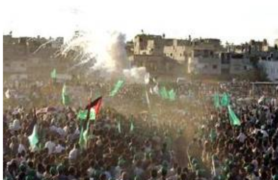
The explosion during the military parade