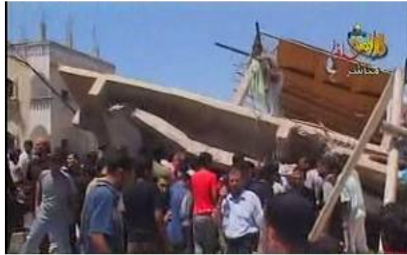
The flattened house in Beit Lahiya (Al-Aqsa TV, June 12)