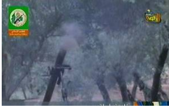
Izz al-Din al-Qassam Brigades “return fire” at Israeli population centers (Al-Aqsa TV, June 12)