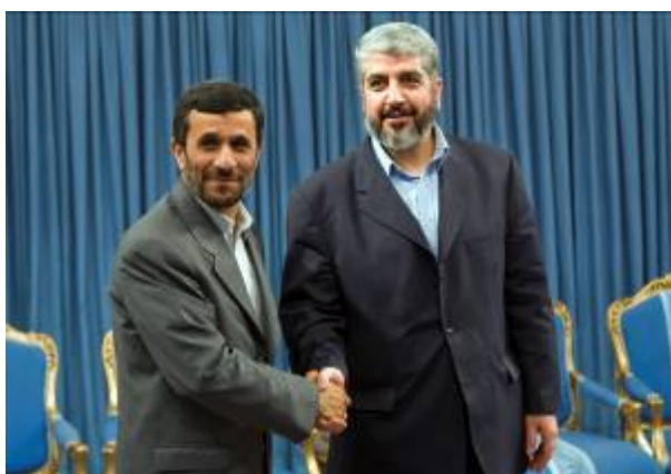
Khaled Mashal meets Iranian president Ahmadinejad.