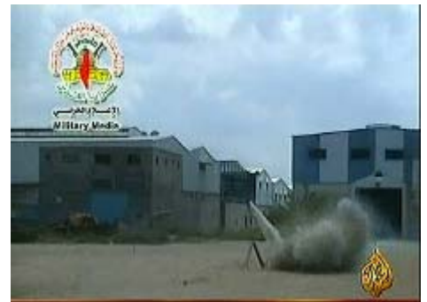
Firing rockets into Israeli territory, from a Jerusalem Battalions video cassette claiming responsibility for an attack. Residential buildings are clearly evident (Al-Jazeera TV, May 25).

■ During the past week Hamas's participation in rocket fire was evident. On May 23 Hamas claimed responsibility for two rockets fired at Sderot (Al-Quds Website, May 23), and for rockets and mortar shells fired at IDF forces and population centers near the Gaza Strip. The PIJ, the PFLP and Fatah also participated in the rocket fire.