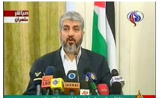
Khaled Mashal at a press conference in Iran after a meeting with the Iranian foreign minister.

■ On the practical level, the London-based Arabic newspaper Al-Sharq Al-Awsat reported that the Iranians had agreed to increase support for Hamas to $150 million in the second half of 2008, and promised to deliver the weapons Hamas wanted. According to the news item the aid will be given on the condition that Hamas holds neither direct nor indirect negotiations with Israel. It was also reported that the commander of the Revolutionary Guards promised Khaled Mashal they would deliver upgraded rockets manufactured especially for Hamas at the Bakri Center [for the manufacture of weapons] in Tehran (Al-Sharq Al-Awsat, May 25).