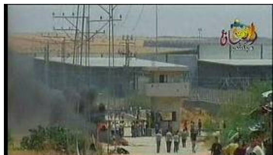
Demonstration at the Karni Crossing on May 22, organized by Hamas.