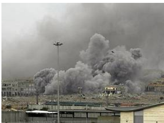
A truck loaded with explosives blows up at the Erez Crossing ( Hamas's PALDF Forum, May 22).