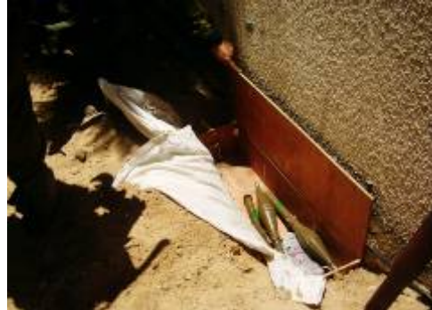
A rocket launcher and a number of anti-tank missiles uncovered in an IDF action in the northern Gaza Strip on May 22. The weapons were hidden on the grounds of a school on the outskirts of the town of Saja'iyah (Pictures courtesy of the IDF Spokesman, May 22).