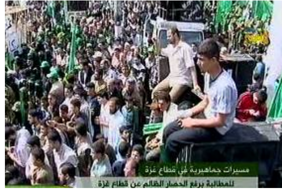
Rally protesting the "blockade" (Al-Jazeera TV, April 11).