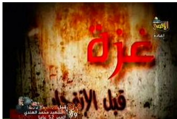
Hamas media campaign: a TV program called "Gaza is about to erupt" (Al-Aqsa TV, April 9)

■ The Hamas campaign includes the threat to use the Palestinian population, which is about to erupt, for protest actions. The campaign continued and intensified after the attack at Nahal Oz on April 9. Hamas's media participated in the campaign with the slogan "Gaza is about to erupt" and broadcast many programs dealing with the "situation," exploiting pictures of children, including badly injured children, to drive home the distress of Gaza Strip residents (Daily Al-Aqsa TV broadcasts).