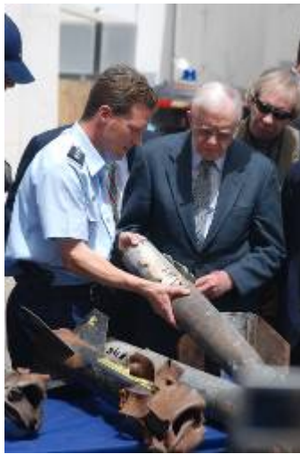
Former American president Jimmy Carter examining the remains of a rockets in Sderot