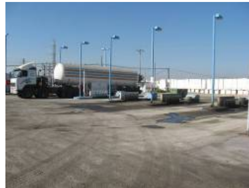
The Nahal Oz fuel terminal where two workers were shot and killed in a combined Palestinian Islamic Jihad-Popular Resistance Committees attack on April 9.