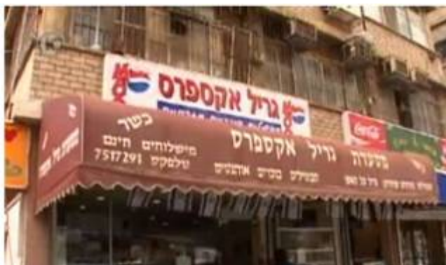
The Express Grill in Ramat Gan where the two planned to poison the food (Picture courtesy of Israeli Channel 10 TV, April 10).