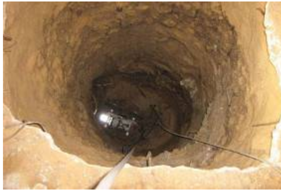
Tunnel shaft uncovered by Israeli security forces in the northern Gaza Strip.

■ IDF forces uncovered a tunnel shaft in the northern Gaza Strip. It was three and a half meters (almost 4 yards) deep, and had been dug inside a building located 700 meters (about 4/10 of a mile) from the security fence. It was apparently intended to be used by a terrorist squad to infiltrate into Israeli territory to carry out a terrorist attack.