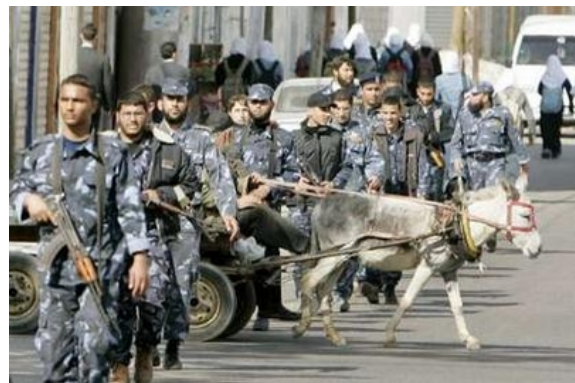
Gaza police patrolling on horseback and on foot, claiming there is no gas for their cars.