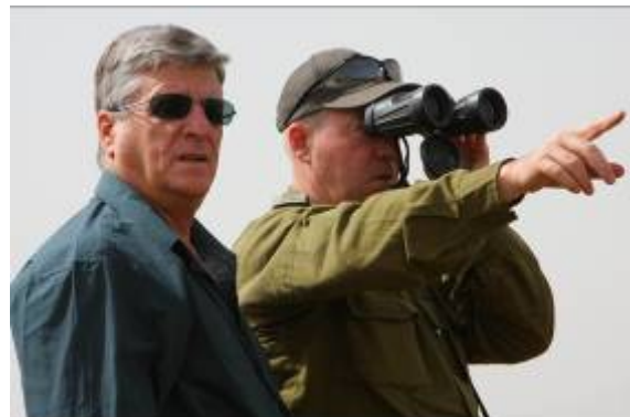
Left: Chief of the Southern Command surveying the fields of Kibbutz Nir Oz. Right: Izzedine al-Qassam Brigades terrorist operative firing a mortar shell (From a video claiming responsibility for rocket fire broadcast by Al-Aqsa TV, April 14).