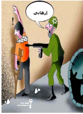
An Israeli soldier portrayed as a stereotypical Jew threatens a Palestinian invalid with only one leg, calling him “terrorist” (Al-Hayat al-Jadeeda, May 20, 2006).