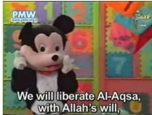
The figure of Mickey Mouse in the program “Tomorrow’s Pioneers’ (Al-Aqsa TV, May 10, 2007, courtesy of the Palestinian Media Watch)

that aired in early September 2007 just prior to the beginning of the school year featured a boy whose field of expertise was jihad (holy war). 3