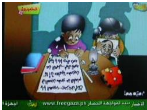
A Palestinian boy writes a letter to his father in jail, while his sister holds the father’s photograph. Both appear sad. The child writes, “Dear Dad, it makes me sad that you’re on a hunger strike in jail, the way our teachers are striking... When will you come back to us, Dad... When will you come back...”