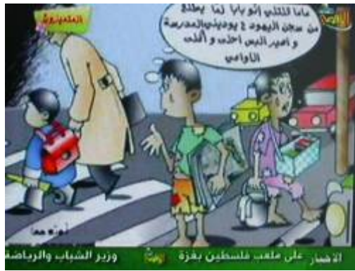
A crying Palestinian child dressed in rags looks at a well-dressed Palestinian child crossing the road with his father. The sad child says, “Mom told me that when Dad gets out of the Jews’ jail, he will take me to school and I’ll be wearing nicer, more expensive clothes.”