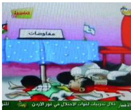
The table of the negotiations between Israel and the Palestinians. The text on the table reads “Negotiations”, and the flags of Israel and Palestine appear on its sides. The floor near the empty Israeli chair is strewn with the bodies of Palestinian children and women. A stereotypically Jewish image of an Israeli soldier shooting indiscriminately into Palestinian civilians is shown on another cartoon (which appears on the title page).