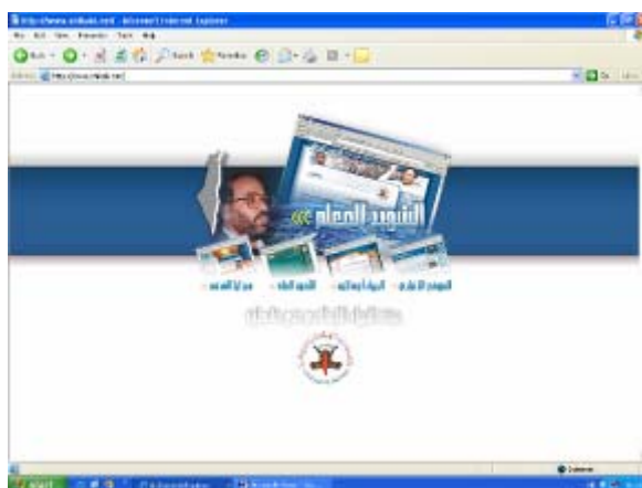
The site's homepage

Palestine [from the Hezbollah side] is a fine Islamic reaction, opposed by the technology of the imperialist [i.e., Israel] and its monstrous equipment, both helpless.”