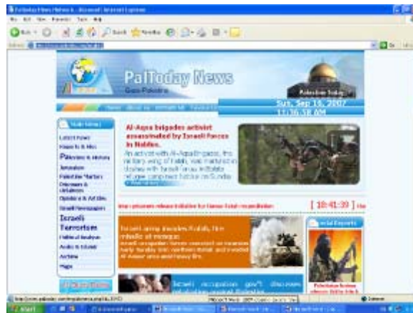
The English homepage (September 16, 2007): the site focuses on defaming Israel and reporting on terrorist attacks carried out against it.