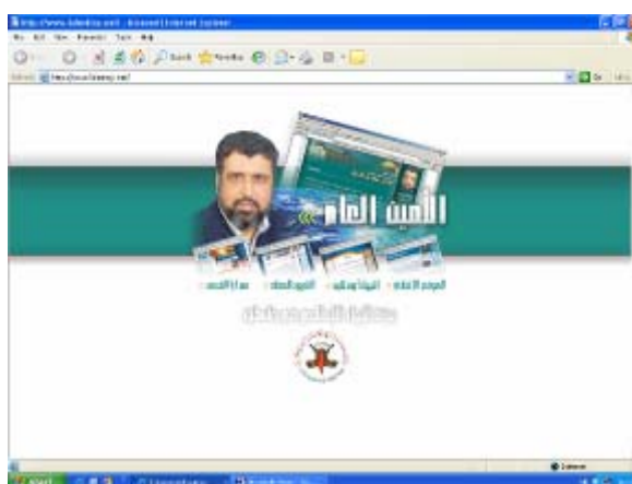
The site's homepage.

17. The site is dedicated to the movement's leader, Abdallah Ramadan Shalah . Previously its address was www.rabdullah.net , which is no longer operative. The site features information about Abdallah Ramadan Shalah, his speeches, remarks, lectures, interviews and pictures. It reveals his radical Islam ideology, including hate-propaganda against Israel.