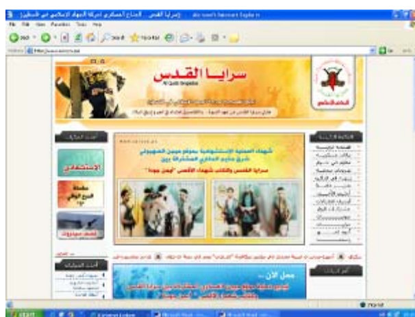
The site's homepage (September 10, 2007): The “will” of the terrorists who tried to infiltrate Israeli territory to attack an IDF post or patrol north of Kissufim. 10