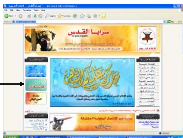
The site's homepage (September 16, 2007). Left: a video documenting PIJ terrorist activities.

A video entitled “Al-isthishhadi” (“The suicide bomber”)