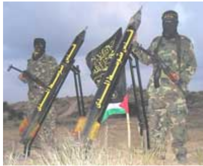
Qassam rockets ready to launch: illustration (www.qudsway.com)

Gaza Strip at populated areas in the western Negev. Palestinian Islamic Jihad spokesmen stated that the killing of the two operatives was proof that Israel does not uphold the ceasefire understandings. “All options are available,” according to the spokesmen, including rockets and suicide bombing attacks (“Pal today”, the Palestinian Islamic Jihad website, December 20, 2006).