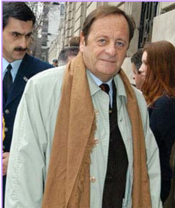
השופט רודולפו קניקובה קורל