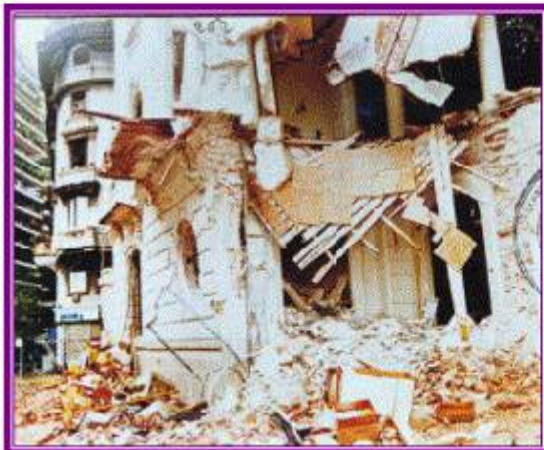
ההרס שנגרם בעקבות הפיגוע

ב. תחנת הרדיו של חזבאללה טענה כי ארה"ב מנהלת מסע לחצים בינלאומי על חזבאללה על מנת לטרפד כל מאמץ להקמת ממשלת אחדות לאומית בלבנון (שאת הקמתה דורשת חזבאללה). חזבאללה טענה כי כחלק ממסע לחצים זה יש לראות את האשמות התובע הכללי הארגנטינאי, שהינן, לטענת חזבאללה, חסרות יסוד ("רדיו נור", 25 באוקטובר).