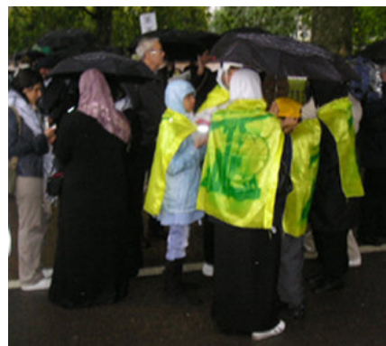
Hezbollah capes, hats and flags for sale in London during the demonstration ( http://publicansdecoy.livejournal.co2 ).