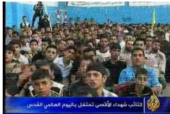
Fatah/Al-Aqsa Martyrs' Brigades rally