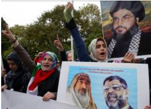
Demonstrators carrying pictures of Hassan Nasrallah, ‘Abd al-‘Aziz Rantisi and Ahmad Yassin (Al-‘Alam, October 20).