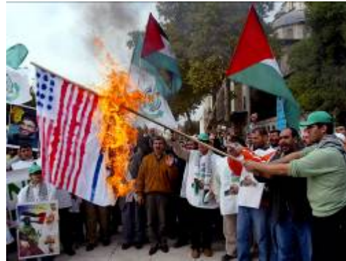
Demonstrators burning the America flag in front of the Fateh mosque in Istanbul (Al-‘Alam, October 20).