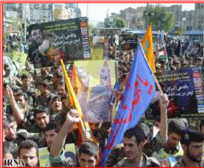
A Jerusalem Day parade in Teheran. Note the picture of Hassan Nasrallah.