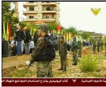
The Jerusalem Day parade in the south Lebanon village of Kila watched by South Lebanese Army soldiers (Al-Manar TV, October 20).

☑ Sheikh Na'im Qassem expressed his hope that “the victory of the faithful” was close and that Jerusalem would be “liberated” by the use of main force. He noted that jihad was the main principle behind the events of Jerusalem Day and that it was “ the day of weapons, resistance and liberation by force. ” He called for the “the might of weapons” to “pull the Zionist entity out by the roots” and for Palestinians to continue their struggle until the “liberation of all Palestinian lands” (Al-Manar TV, Hezbollah’s Al-Intiqad portal and IRNA News Agency, October 20).