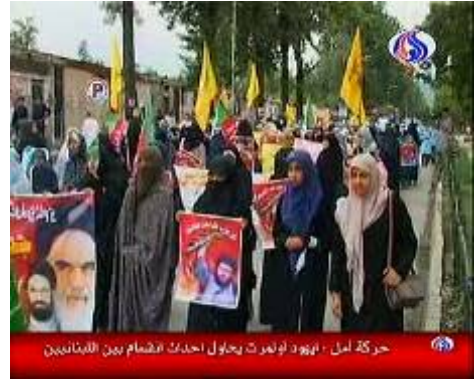
Jerusalem Day ceremonies in Karachi (Al-‘Alam, October 20)