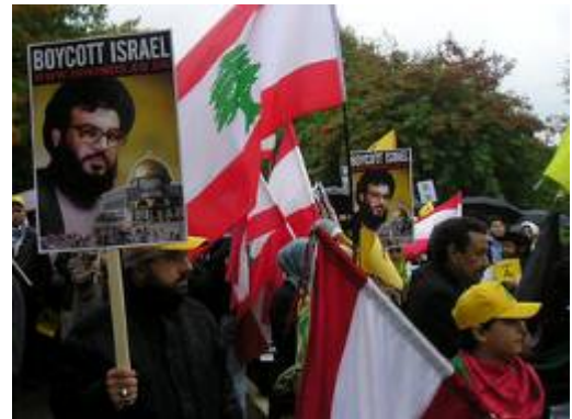
Demonstrators in London carrying Lebanese and Hezbollah flags and pictures of Hassan Nasrallah with the Dome of the Rock in the background and the inscription “Boycott Israel” 4 ( http://publicansdecoy.livejournal.co2 ).