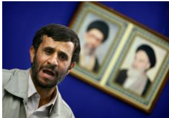
Ahmadinejad during the Friday prayer at Teheran University.

☑ On October 20, the eve of Jerusalem Day, a mass parade was held in Teheran attended by Iranian president Ahmadinejad. Banners denouncing Israel were carried and the ritual of burning the Israeli flag was performed. Similar events were held in other cities in Iran. Speeches were made by Ahmadinejad and other senior members of the Iranian government. The prominent themes were the call for the destruction of Israel, hatred for the Western powers and a warning that the Middle East would produce a “hurricane” that would spill over into the countries supporting Israel. Iran also asserted its determination to advance its nuclear program and its denial of the Holocaust.