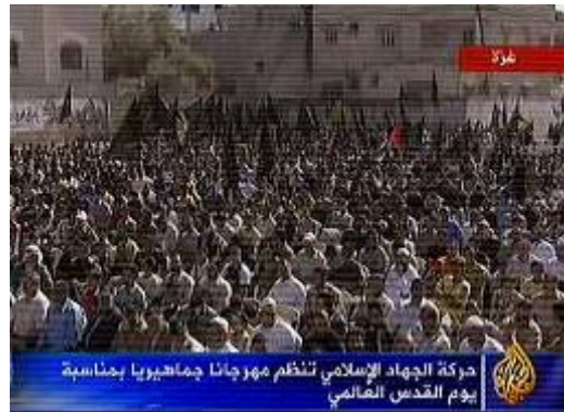
The PIJ rally in Gaza (Al-Jazeera TV, October 20)

the heart of the Palestinian nation...Israel is on its way to disappearing and nothing will ever make us recognize it ” (www.Paltoday, the PIJ’s Website).