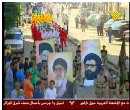
Parades in Lebanon attended by the Imam al-Mahdi Scouts, Hezbollah's youth organization. The marchers waved signs bearing pictures of Hassan Nasrallah, Khomeini and Khamenei (Al-Manar TV, October 20).