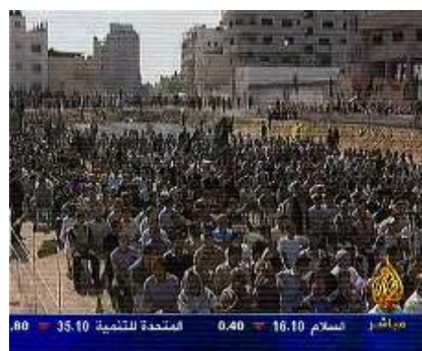
Hamas Jerusalem Day rally (Al-Jazeera TV, October 20)