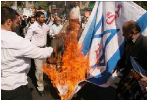
Demonstrators burn the Israeli flag during Jerusalem Day in Teheran. On the flag is written, “Death to Israel.”

✓ On a speech given during the breaking of the Ramadan fast on October 18, Mottaki said: “The tocsin of the fall of the Zionist regime has begun to sound and the regime has proved itself to be hollow. When a regime loses its legal base it becomes shaky...” (IRNA News Agency, October 18).