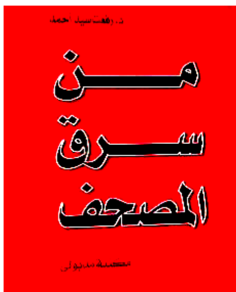
The front cover