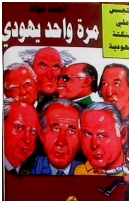
The front cover: unflattering caricatures of former Israeli prime ministers, and a laughing man (lower right corner)