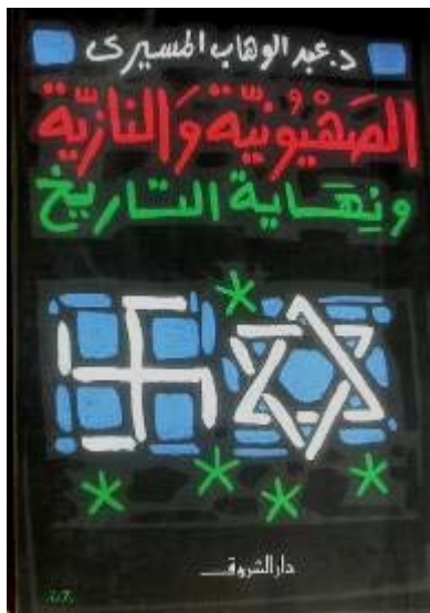
The front cover