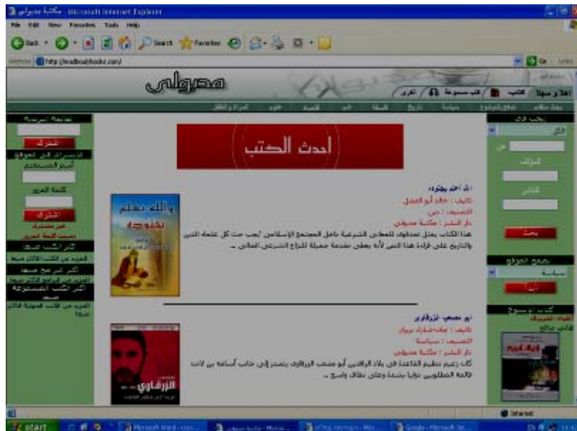
The Madbouly Publishers’ home page

⌘ Madbouly Publishers is a large, well-known publishing house located in Cairo, most of whose books deal with politics, society and religion. Its Website is madboulybooks.com.