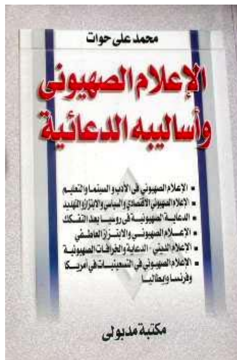
The front cover