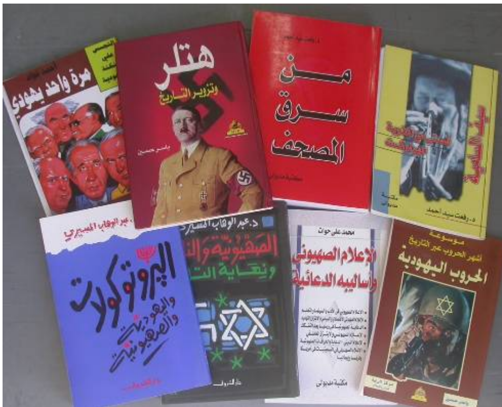
A selection of anti-Semitic books published in Egypt during the past few years and sold at the International Book Fair in Qatar in December 2005

The Arab hate industry: Egypt continues as a center for the publication of crude anti-Semitic literature encouraging hatred for Israel, the Jewish people and the West, and in effect justifying the use of violence against them.