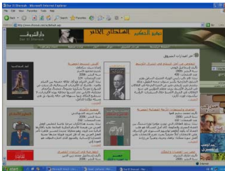
The Dar al-Shorouk Publishers' home page