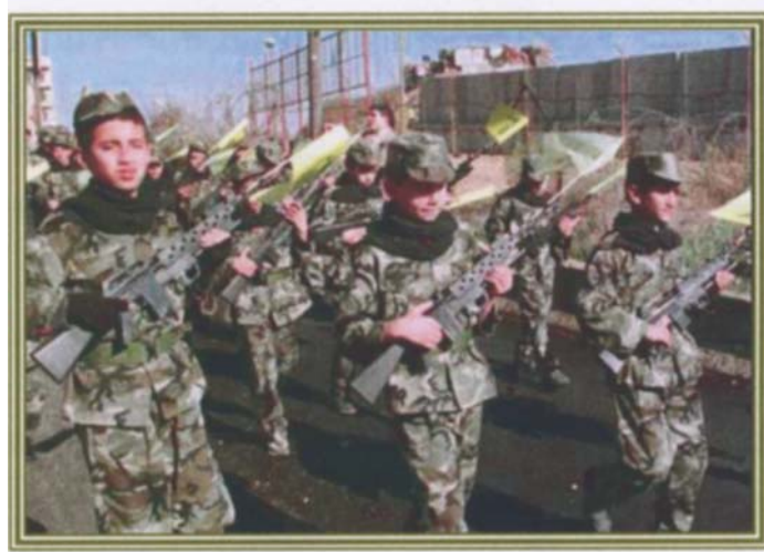
Children wearing military camouflage uniforms and carrying Hezbollah flags in a parade. The educational institutions are raising the younger generation on the principles of violence and hatred for Israel.

☸ The Islamic Resistance Support Association also plays an important role in the battle for hearts and minds , especially of the younger generation, as is well-illustrated by the captured documents. The intention is to instill the youth with the principles of Hezbollah's radical Islamic ideology and the concept of the jihad against Israel and the struggle against the United States and the west according to the Shi'ite Islamic ideology exported by Iran to Lebanon. 1