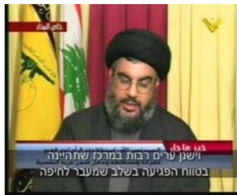
Hassan Nasrallah threatens to strike the center of Israel (Al-Manar TV, July 29).

✦ Hassan Nasrallah has kept a low profile and made only three televised speeches and given only one interview (to Al-Safir). His statements have been relatively short, he seems tired and his apologetic tone shows signs of distress. In his statements to the media he has attempted to deter Israel from continuing the confrontation and to support the Lebanese government’s demand of an immediate ceasefire, which would