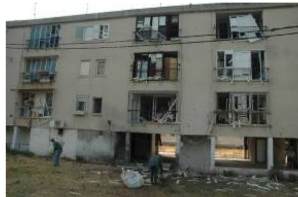
Apartment buildings damaged by rocket fire in Carmiel (left) and Nahariya (right) (Photographs courtesy of the Israeli Police Department).