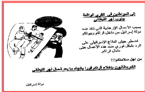
Left: An Al-Arabiya TV reporter holding an IDF leaflet (Al-Arabiya TV, July 26). Right: A leaflet distributed by the IDF in south Lebanon calling upon residents to leave their houses.