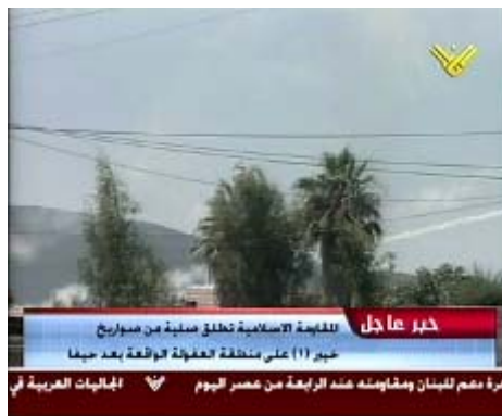
A long-range rocket launched at Afula (Al-Manar TV, July 28).

✓ Launch times: Hezbollah launches its rockets during the day . It usually starts in the morning and increases the number toward noon and the afternoon hours.