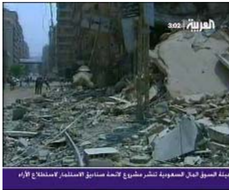
A building in a southern suburb of Beirut after an Israeli Air Force attack (Al-‘Arabiya TV, July 27).

✦ While the Air Force has carried out attacks, the IDF has carried out limited ground operations within Lebanon along to the border in order to destroy the strongholds built by Hezbollah after the IDF withdrew from Lebanon in May 2000 . Armored and infantry forces and engineering corps have been involved, and since July 20 the activity has focused on the village of Maroun al-Ras and the town of Bint Jbail , two prominent Hezbollah strongholds in the south. After a number of days of fierce fighting and having suffered losses, the IDF managed to take control of the Hezbollah strongholds in the two settlements.