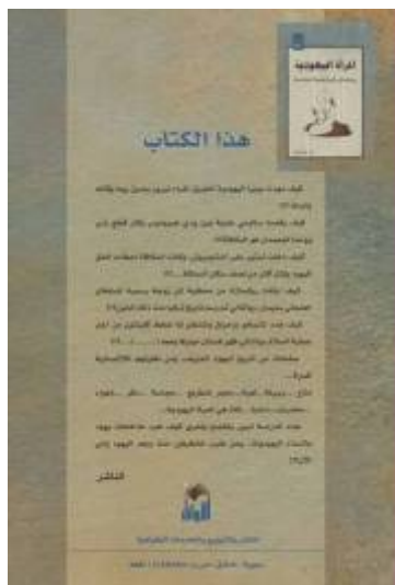
The book's back cover

Publishing house: Dar al-Awael, Jalaboune, Damascus