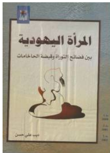
The cover of the book

The book's back cover, featuring the following absurdities: