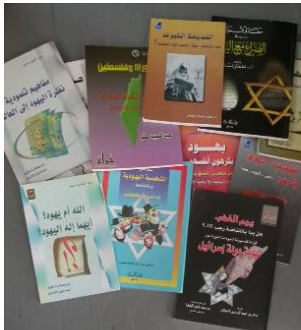
A selection of anti-Semitic books offered for sale at the 17th International Book Fair, held in Qatar in late December 2005.

Syria as a source for the distribution of anti-Semitic literature: while the Syrian regime fans protest demonstrations due to the publication of the cartoons which hurt Muslims' feelings, Syria continues to export anti-Semitic books to the Arab and Muslim world. These books are meant to inspire hatred against Jews, portray them as infidels, and lay the foundation for acts of violence against them.