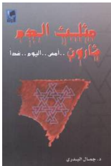
The cover of “The blood triangle, Sharon: yesterday, today, tomorrow”

☐ “The blood triangle, Sharon: yesterday, today, tomorrow” intends to demonize Jews through the character of Prime Minister Ariel Sharon. The use of Prime Minister Ariel Sharon’s character as a means to assimilate anti-Israeli and anti-Semitic messages has become commonplace across the Arab world in recent years. It is reflected in books, articles in the press, television shows, and cartoons. 15