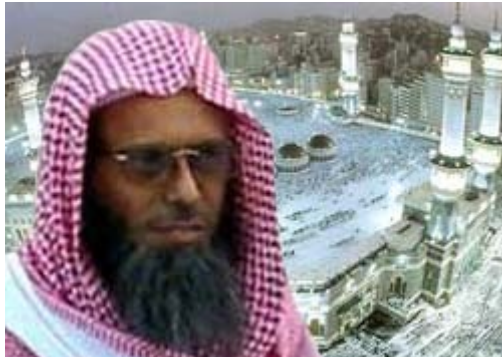
Sheikh Safar Abd al-Rahman al-Hawali

☐ The author of the book is Safar Abd al-Rahman al-Hawali , a Saudi sheikh with a doctorate, formerly one of the leaders of the opposition against the Saudi regime in the early 1990s, who was even held in prison for several years. The author is highly prolific, having written books and articles on religion and politics. On his website ( www.alhawali.com ), he preaches on Islamic religious issues and also engages in