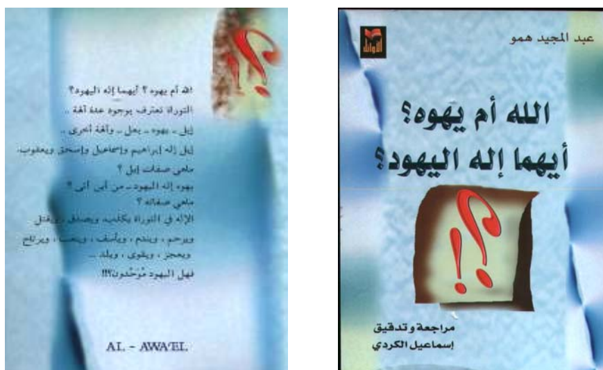
The anti-Semitic book “Allah or Jehovah? Which one is the God of the Jews?” Front cover (right), back cover (left)

Publishing house: Dar al-Awael, Jalaboune, Damascus