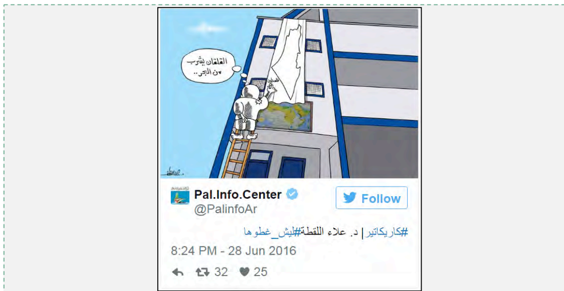
A cartoon from Hamas' Twitter account in response to the outcry over Ban Ki-moon's visit to the UNRWA school. There is a picture of a Palestinian child, 3 who points to the covered map of "Palestine" and says, "Anyone who is worried is invited to drink seawater..." (Twitter account of Palinfo, June 28, 2016).