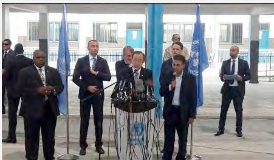
UN Secretary General Ban Ki-moon holds a press conference in the Gaza Strip.

1. On June 28, 2016, Ban Ki-moon spent a few hours in the Gaza Strip. The visit was part of trips he is making to mark the end of his term of office as UN secretary general. He entered through the Erez crossing. While in the Gaza Strip he was taken to an UNRWA school in Gaza City and a rehabilitation center. He also met with UNRWA employees. He held a press conference where he warned that the continuation of the closure of the Gaza Strip, which he referred to as "collective punishment," would increase the probability of renewed escalation. He thanked the countries that had contributed to the reconstruction of the Gaza Strip.