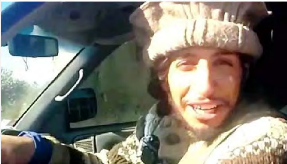
From a video posted to Twitter showing Abdelhamid Abaaoud smiling and driving a pickup truck dragging ISIS victims.

7. Apparently, at the beginning of his career in ISIS, Abdelhamid Abaaoud dealt with "routine" combat and logistic missions. During his stay in Syria he was photographed smiling from ear to ear while driving a pickup truck dragging the bodies of people murdered by ISIS (Daily Mail, November 18, 2015). According to a Syrian human rights organization, while in Syria he was made commander of the region of Deir al-Zor (All4syria, August 14, 2015). He also reportedly recruited Belgian operatives for ISIS , for which he was sentenced in absentia to twenty years in prison. 4