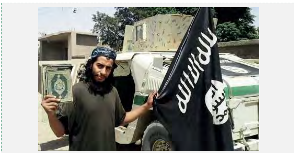
Abdelhamid Abaaoud in Syria with an ISIS flag (Dabiq, #7, February 7, 2015).

9. In February 2015 Dabiq , ISIS's English-language magazine, published an interview with Abdelhamid Abaaoud. Its objective was probably to encourage European operatives to return to their native countries for terrorist missions. The interview glorified the "epic escape" of Abdelhamid Abaaoud from Belgium, emphasizing his success in evading the security forces pursuing him. The interview indicated a considerable amount of self confidence and daring on the part of ISIS, which did not hesitate to publish pictures of Abaaoud, and to send him on a new operational mission to Belgium and France a short time later (most likely around March 2015).