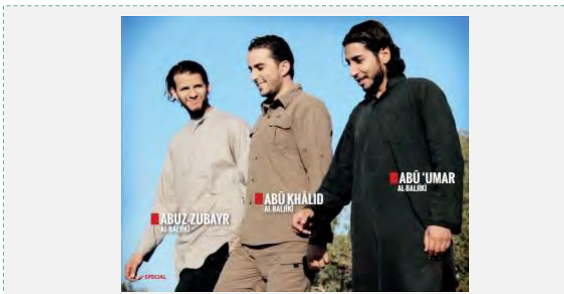
Abdelhamid Abaaoud, aka Abu Omar the Belgian (right), with two other terrorist operatives sent by ISIS for a terrorist mission in Belgium ( Dabiq , Issue #7, February 2015). The two were killed in a Belgian security force raid.