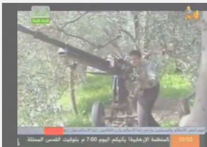
Abdallah Mortaja firing a heavy machine gun.