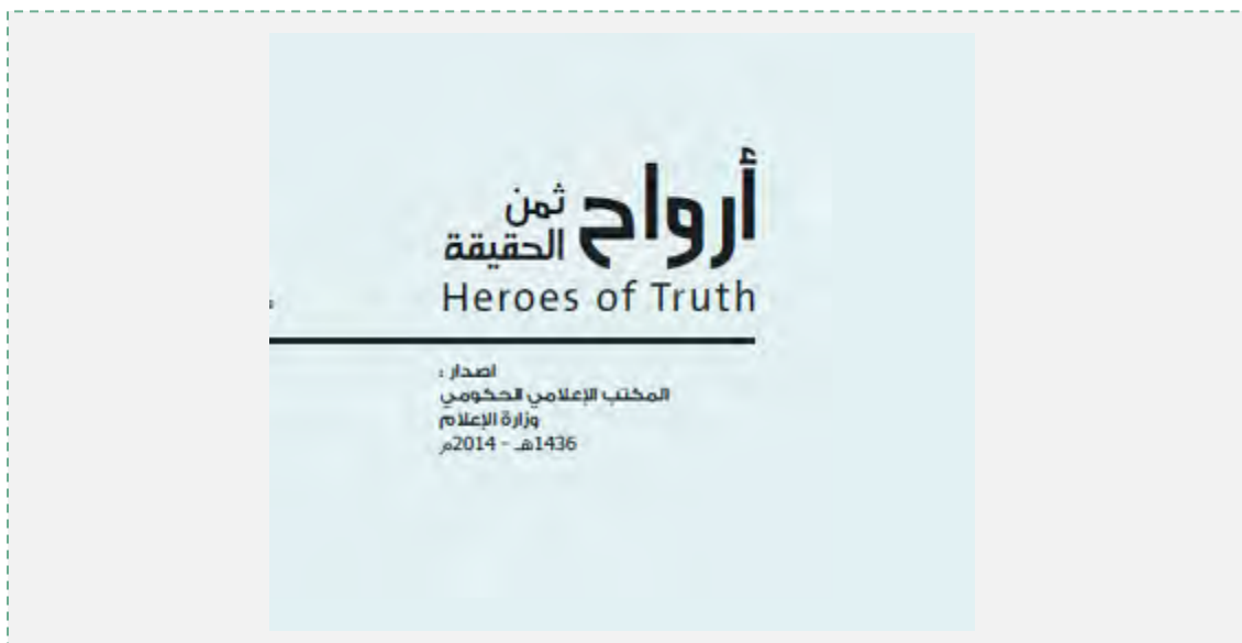
The title page of the Gaza office of the ministry of information's misleading, inaccurate publication about the 17 journalists killed in Operation Protective Edge.