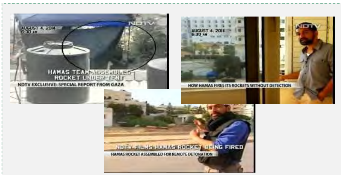
Left: The blue tent erected to hide the operatives. Right: The correspondent next to the window in his hotel room. Bottom: He tries to approach to launch site. Click https://www.youtube.com/watch?v=k_ihf2omMX4 for the video.