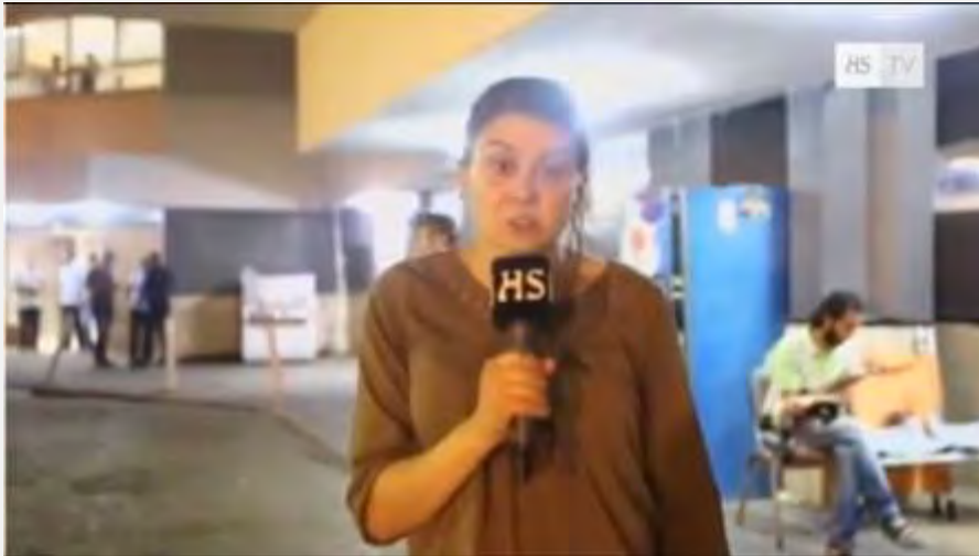
The Finnish correspondent reporting from Al-Shifa'a Hospital on rocket fire from the hospital's parking lot ( https://www.youtube.com/watch?v=Nu-e5qWXx-k )