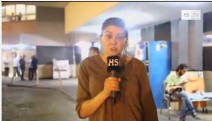
A correspondent from the Finnish TV channel HS-TV reports on rocket fire from close proximity to the Al-Shifa'a Hospital ( https://www.youtube.com/watch?v=Nu-e5qWXx-k )