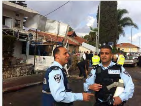
Left: A home in Sderot takes a direct hit (Photo by Edi Israeli, courtesy of NRG, November 11, 2012). Right: A home in Netivot after a direct hit on the morning of November 12 (Israel Police Force Facebook page, November 12, 2012).