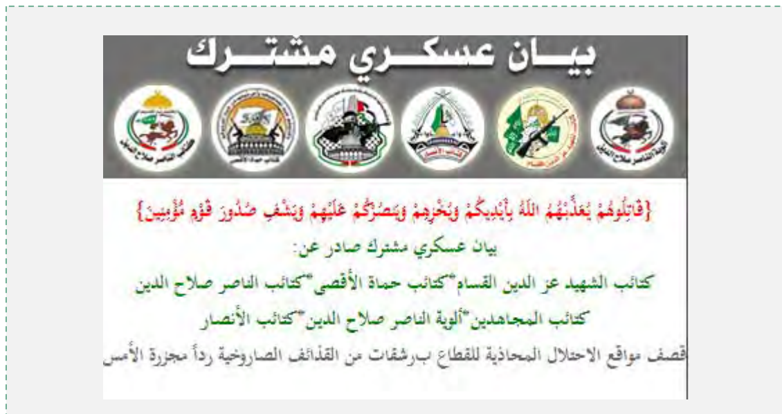
The insignia of the terrorist organizations as they appeared in the announcement posted on the Izz al-Din al-Qassam Brigades website.

7. For example, the Hamas website issued a statement on behalf of its own military-terrorist wing and those of the other Palestinian terrorist organizations claiming joint responsibility for the rocket attacks. The Izz al-Din al-Qassam Brigades website posted a video documenting rocket attacks, showing the insignia of the other terrorist organizations operating in the Gaza Strip (Izz al-Din al-Qassam Brigades website, November 11, 2012). According to the announcement, the terrorist organizations in the Gaza Strip had set up a joint operations room to examine responses (Alresala.net website, November 11, 2012). Hamas spokesmen praised the rocket fire and made threats against Israel.