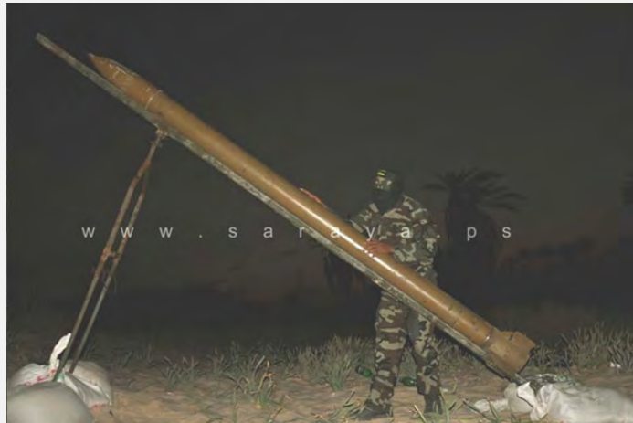
An improved version of the Quds rocket, claimed by the PIJ to have been launched at Beersheba (Jerusalem Brigades website, November 11, 2012).