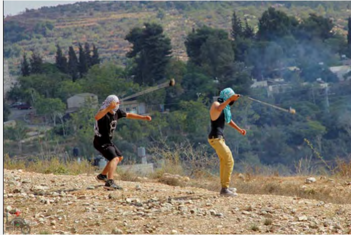
Friday demonstration at Nabi Salih (October 12, 2012).