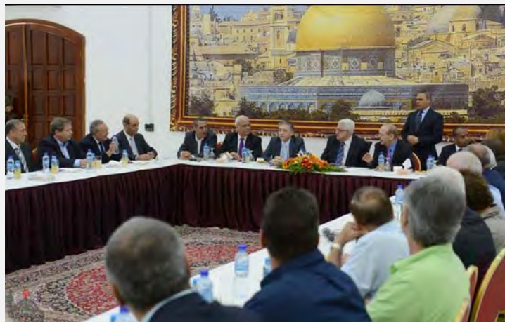
Mahmoud Abbas meets with Israeli Knesset members in Ramallah (Wafa News Agency, October 14, 2012).

■ Saeb Erekat , a member of the PLO's Executive Committee, said that the United States would not be able to prevent the UN General Assembly session next month where the vote on Palestinian membership would be held. He said that an affirmative decision would make it possible for the PA to return to negotiations , because recognition of "Palestine" as a state under occupation would serve as a source of authority for the Palestinian demand that Israel withdraw to the 1967 lines, as well as recognition of the illegality of the settlements and the annexation of Jerusalem (Voice of Palestine Radio, October 15, 2012). Saeb Erekat said in an interview that receiving non-member status in the UN would give the PA access to the International Court where the Palestinians could sue Israel (Ma'an News Agency, October 13, 2012).