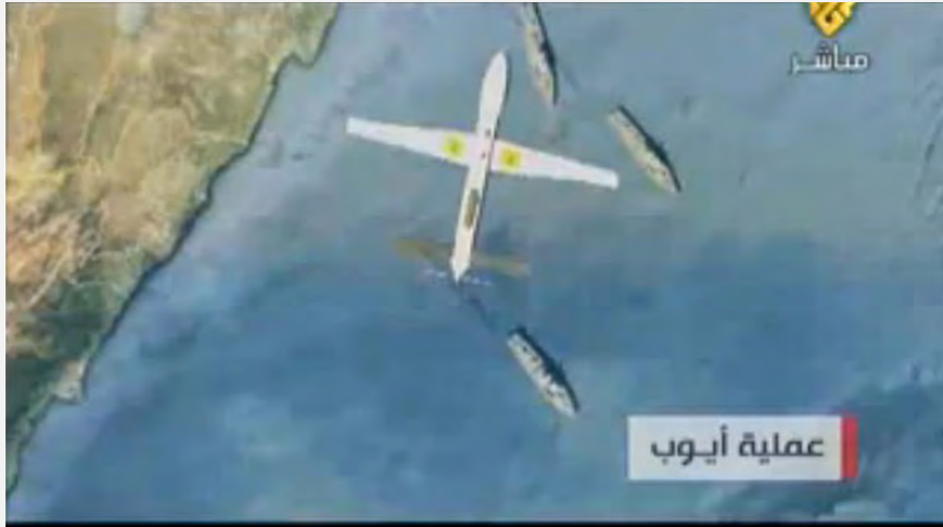
Hezbollah video simulating sending the drone, referred to as the "[Hussein] Ayoub operation," over Israel (Al-Manar TV, Lebanon, October, 2012)