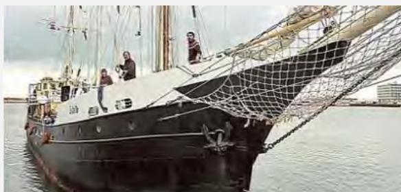
Left: Reception for the Estelle in the port of Naples. Right: The Estelle anchored in Naples (Izz al-Din al-Qassam Brigades website, October 14, 2012).