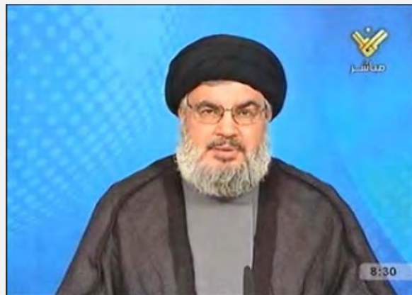
Hassan Nasrallah delivers a speech claiming responsibility for sending a drone to penetrate Israeli airspace (Al-Manar TV, Lebanon, October 11, 2012).