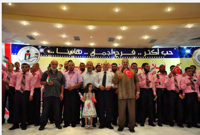
Mass PIJ wedding financed by the Turkish IHH, whose logo appears at the right. The flags bear the Turkish crescent.