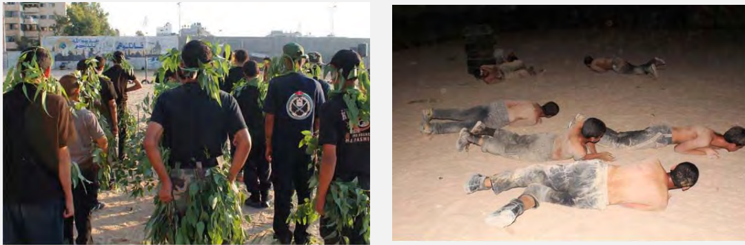
Children at Hamas summer camps undergo paramilitary training (Pictures from the PALDF website, July 22, 2012).