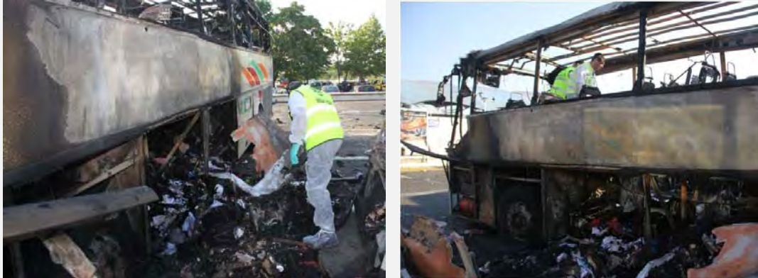
The Hezbollah terrorist attack in Bulgaria: Remains of the bus at the Burgas airport (ZAKA spokesman, July 19, 2012).