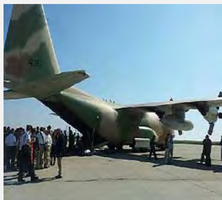
Israeli medical assistance delegations in action in Bulgaria (IDF Spokesman, July 18, 2012).