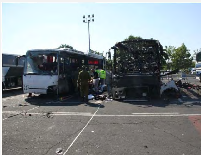
The burned-out bus at the airport in Burgas, Bulgaria (ZAKA spokesman, July 19, 2012).