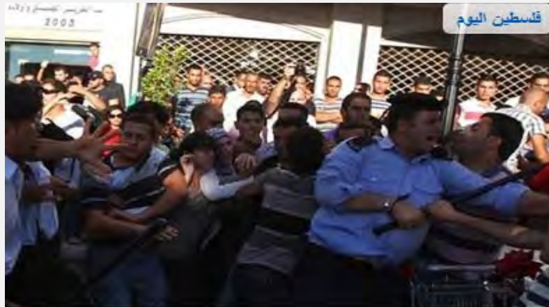
The Palestinian police suppress a violent demonstration in Ramallah.