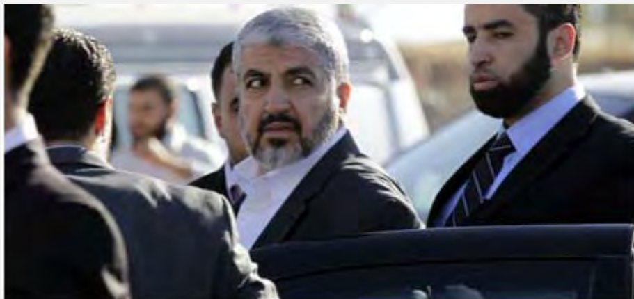
Khaled Mashaal on a visit to Jordan (Izz al-Din al-Qassam Brigades website, July 3, 2012).

the issue was not currently on the agenda , and that what they were hoping for now was comprehensive relations (Al-Sabil, June 30, 2012).