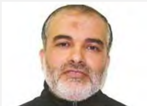
Ibrahim Hamad (IDF Spokesman, July 2, 2012).