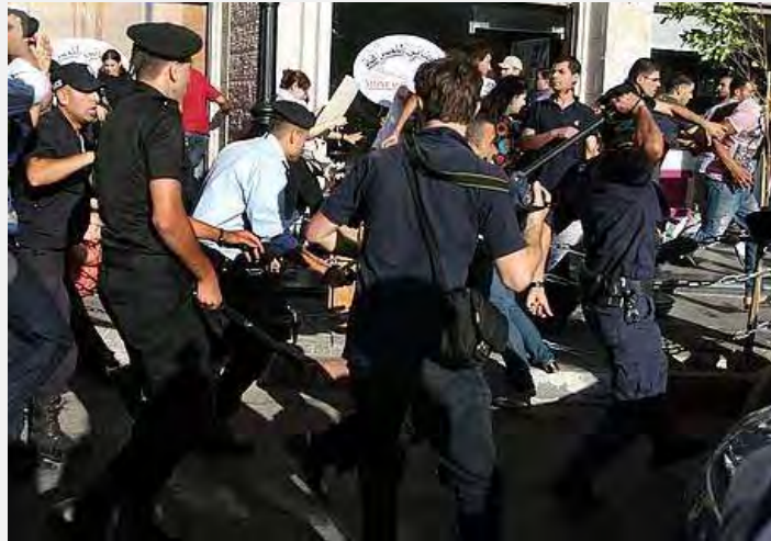
The Palestinian police suppress violent demonstrations in Ramallah ( Hamas' palestine-info website, July 2, 2012). One of the demonstrations (on June 30) protested the planned (and cancelled) visit of Israeli Vice Prime Minister Shaul Mofaz.