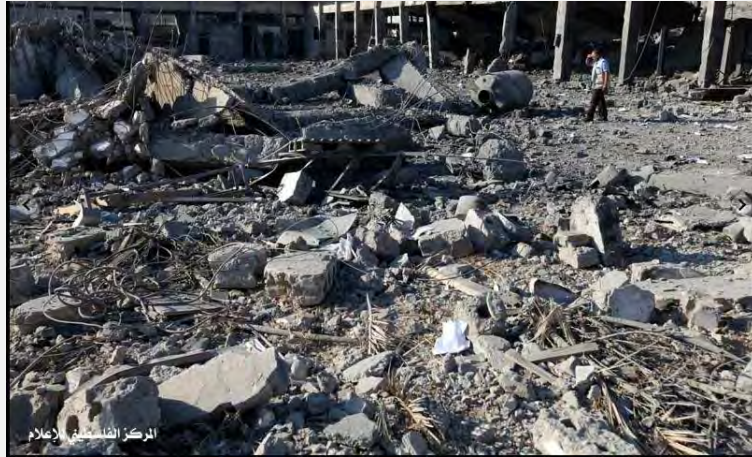
The aftermath of the IAF strike

3) On June 22 IAF aircraft struck a terrorist squad in the central Gaza Strip which was preparing to fire rockets into Israeli territory . Another squad of terrorist operatives was struck after they launched a rocket at Ashqelon from the northern Gaza Strip. The Palestinian media reported one terrorist operative killed and two civilians wounded in the region of Al-Bureij (The PIJ's Paltoday website, June 22, 2012).