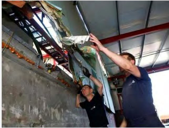
Damage done to the factory near Sderot (Photo by Edi Israel for NRG, June 23, 2012)