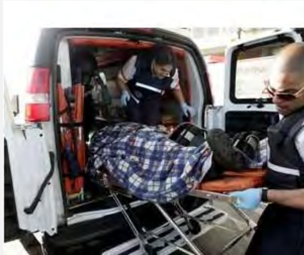
A team of first aid paramedics (Magen David Adom) evacuates the wounded man from the factory in Sderot (Photo by Edi Israel for NRG, June 23, 2012)