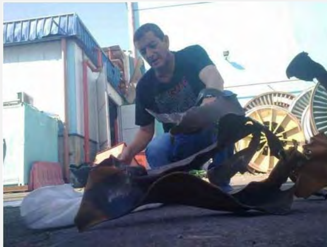
Remains of the rocket which fell near the southern city of Sderot (Photo by Edi Israel for NRG, June 23, 2012)