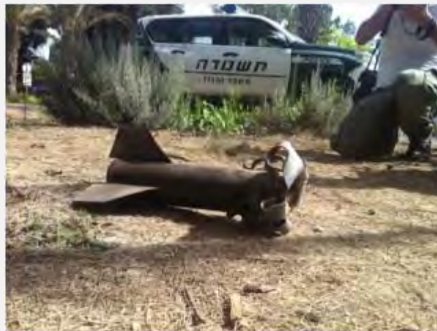
Rocket which fell in a populated area in the western Negev.