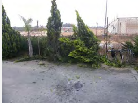
Rockets which fell near population centers in the western Negev.