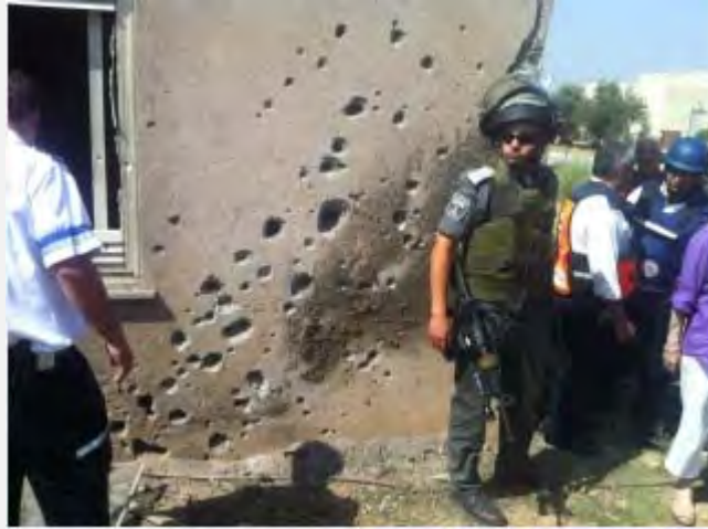
Damage to a residential structure in an Israeli town.