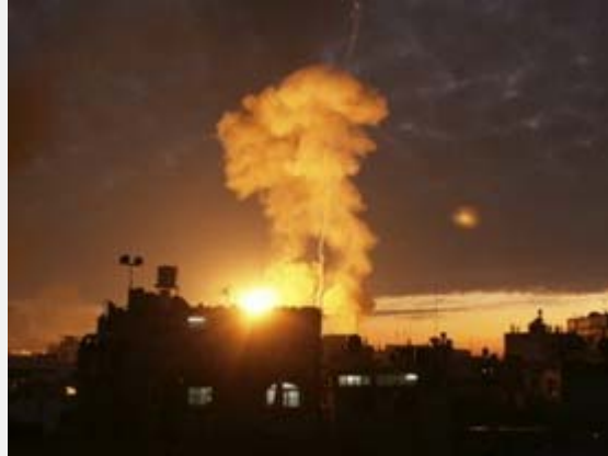
The IAF attacks in the northern Gaza Strip ( Hamas' palestine-info website, June 21, 2012).