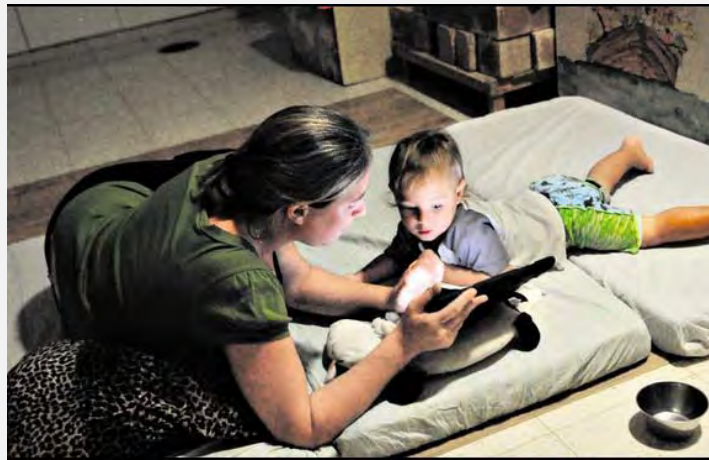
Kibbutz children in a reinforced security room (Facebook, June 20, 2012)