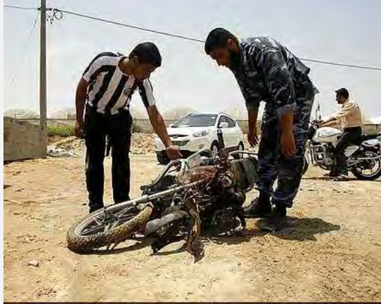
The motorbike ridden by the terrorist operative ( Hamas' palestine-info website, June 21, 2012).