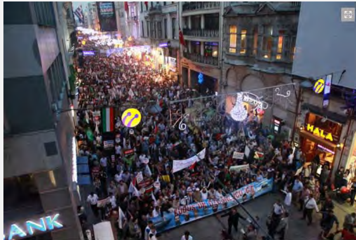
The march in Taksim Square (IHH website, June 3, 2012)

■ On May 31 events were held in Istanbul to mark the second anniversary of the Mavi Marmara . The main event was a march in Taksim Square in the heart of Istanbul. According to the IHH website, it was attended by about 30,000 people. The marchers held signs commemorating the dead, expressing solidarity with the Palestinians and criticizing Syrian President Bashar Assad.