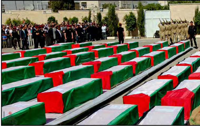
Coffins of the terrorists on display at the Muqataa in Ramallah.

■ Palestinian Authority leaders Mahmoud Abbas and Salam Fayyad did not make public statements. However, the message sent by the official ceremonies and the programs broadcast by the Palestinian media was that the dead terrorists who had carried out suicide bombing attacks were revered and esteemed by Palestinian society and Palestinian politics.