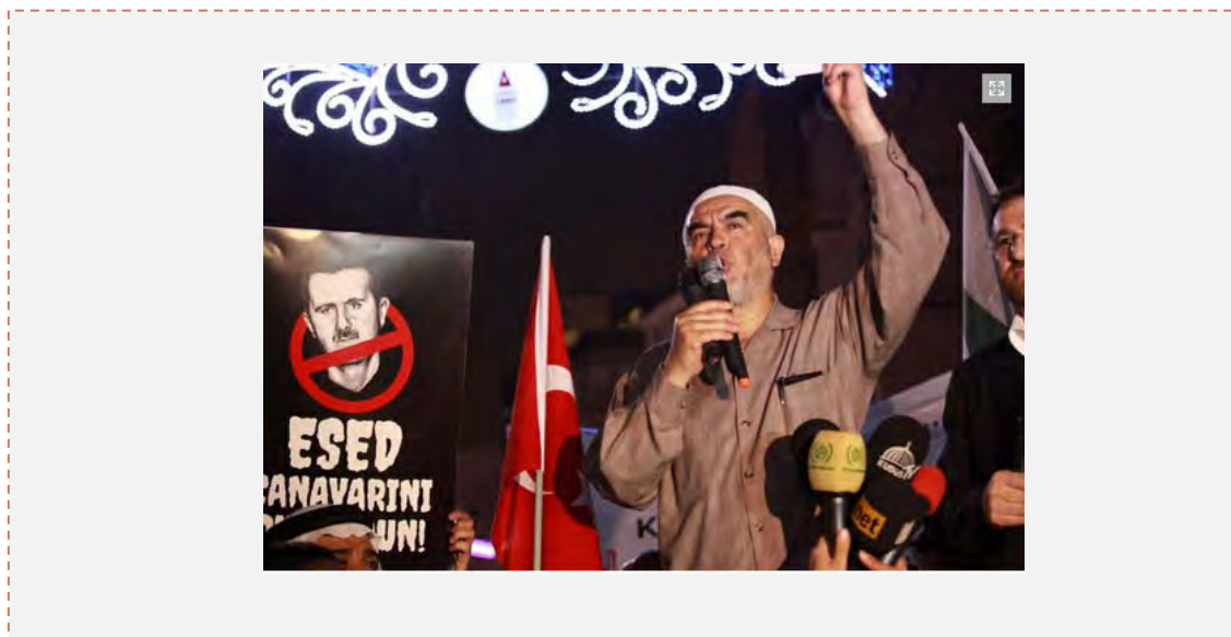
Raed Salah speaks at the ceremony in Istanbul (IHH website, June 3, 2012).

■ "the Israeli murderers would drown in blood and tears," and that "terrorist, occupying Israel lost the war against the Gaza Strip in spite of all its modern weapons." He added that the Mavi Marmara would sail again to liberate Damascus, Homs, Hama and Gaza.