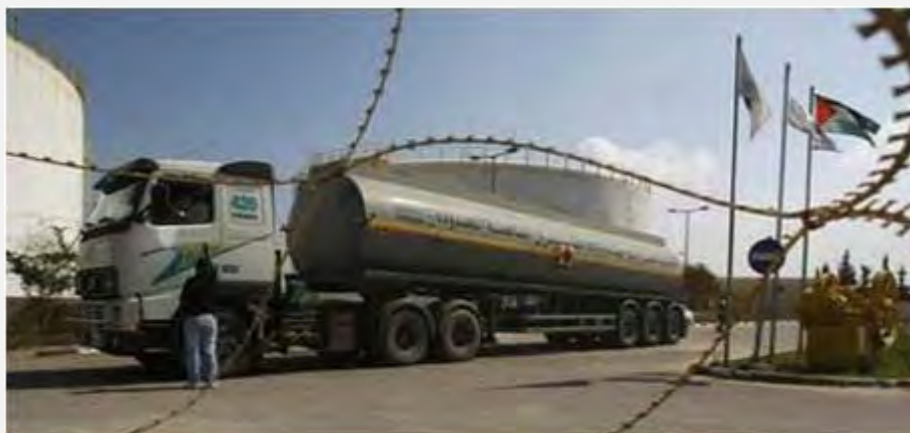
Fuel tanker en route to the Gaza Strip (Izz al-Din al-Qassam Brigades website, June 5, 2012)

■ The Gaza crossings authority said in an announcement that the Egyptians had not yet authorized the delivery to the Gaza Strip of the fuel sent by Qatar. According to the Gazan authority, it is possible that on Thursday, June 7, delivery will be permitted through the Kerem Shalom crossing. The Egyptian authorities say "technical matters" are responsible for the delay. Israel has already agreed to let the trucks enter through the Kerem Shalom crossing (Izz al-Din al-Qassam Brigades website, June 5, 2012).