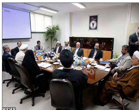
Meeting of the Azad University executive board

Speaking at the same press conference, Daneshjou himself said that only four of the nine university board members had been opposed to holding the vote during the last meeting and demanded that it be postponed until all candidates personally submit their plans for running the university. He said that, prior to the vote, Rafsanjani had told him that he was not opposed to his nomination. He called on the board members to accept the majority opinion and defined the statement released on Rafsanjani's behalf as a decision reflecting the minority opinion (Fars, January 11).