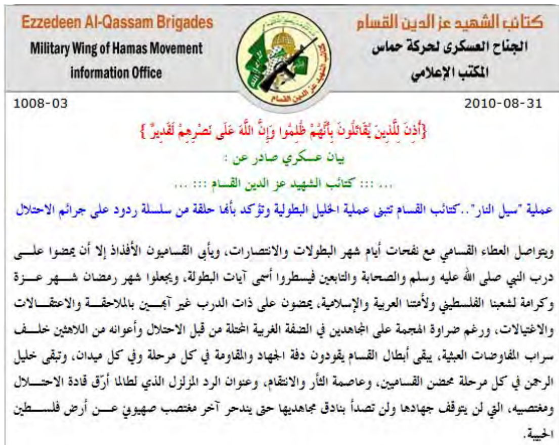
A section of the announcement claiming responsibility for the attack, posted on the Izz al-Din al-Qassam Brigades website (August 31, 2010).

8. In an interview after the attack, Izz al-Din al-Qassam Brigades spokesman Abu Obeida confirmed that the Brigades were responsible. He said that it was one in "a series of actions" carried out in response to the "crimes of the occupation" against the residents of Judea and Samaria and the Muslim holy places, and that more attacks would follow. He also said that the "action" sent a message to the Palestinian Authority that security coordination with Israel was not to its advantage, and that the "natural choice" was "jihad and resistance" [i.e., terrorism] (Al-Aqsa TV, August 31, 2010).