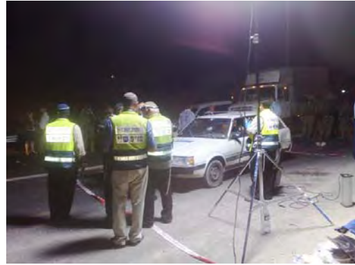
The car at the scene of the terrorist attack (Photograph by Ruby Reuven, ZAKA, August 31, 2010).

5. On August 31 at 19:30 hours an attack was carried out against an Israeli vehicle driving along the road southeast of Hebron. It was apparently a drive-by shooting. The four passengers were sprayed with bullets and dozens of cartridge casings were found in the area. They were shot at close range and according to the Israeli media, the terrorist ascertain their deaths by shooting them again. The attackers fled the scene. The Israeli security forces who arrived on the scene set up road blocks and searched the area to locate the terrorists who carried out the attack.