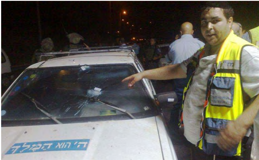
The car at the scene of the terrorist attack (Photograph by Ruby Reuven, ZAKA, August 31, 2010).

On the eve of the summit meeting in Washington to relaunch the direct Israeli-Palestinian negotiations, a shooting attack was carried out targeting an Israeli vehicle southeast of Hebron. Four Israeli civilians were killed. Hamas' military wing claimed responsibility; the Palestinian Authority condemned the attack. 1