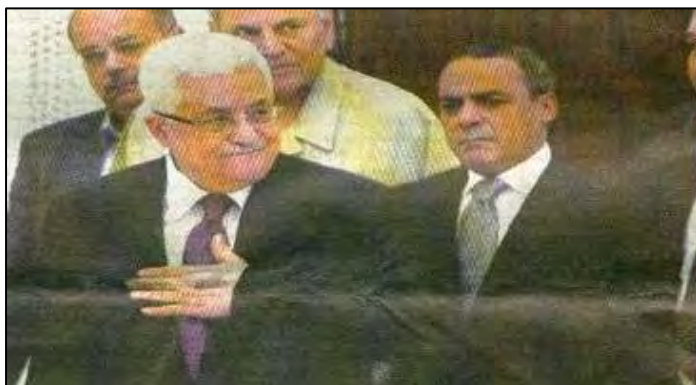
Mahmoud Abbas at a meeting of Fatah's Revolutionary Council in Ramallah (Al-Quds, July 21, 2010).