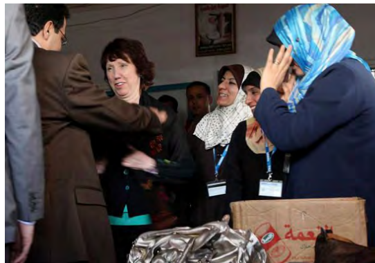
Catherine Ashton visits the Gaza Strip.

■ Ashton called for the release of abducted Israeli soldier Gilad Shalit and to allow the Red Cross to visit him. She said she objected to dispatching more flotillas to the Gaza Strip and called for the opening of the crossings, claiming that the so-called siege of the Gaza Strip was "unacceptable and useless." She also expressed support for the establishment of a Palestinian state and said that the position of the European Union was that the Gaza Strip should be part of a Palestinian state (RTTNEWS, July 19; Wafa News Agency, July 18; EU website, July 18, 2010).