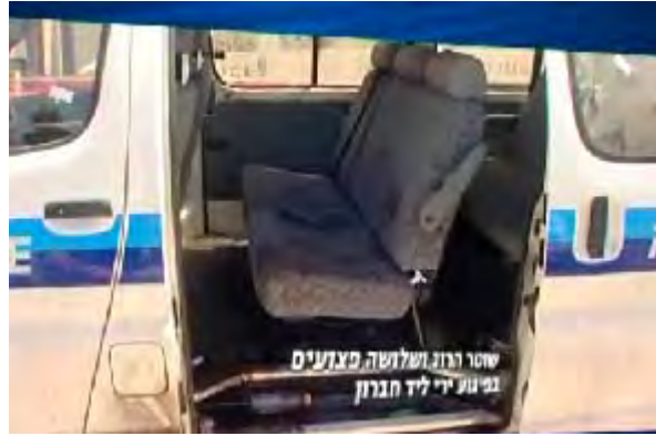
The police patrol car near Hebron after the attack in which an Israeli policeman was killed (June 14, 2010.)