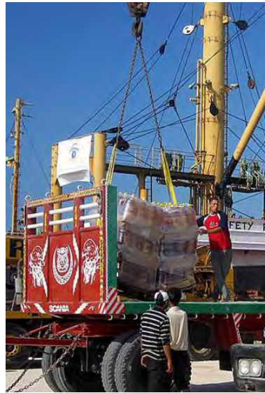
The Amalthea (Amal) unloads its cargo at the port of El Arish (Hamas' Palestine-info website, July 18, 2010).