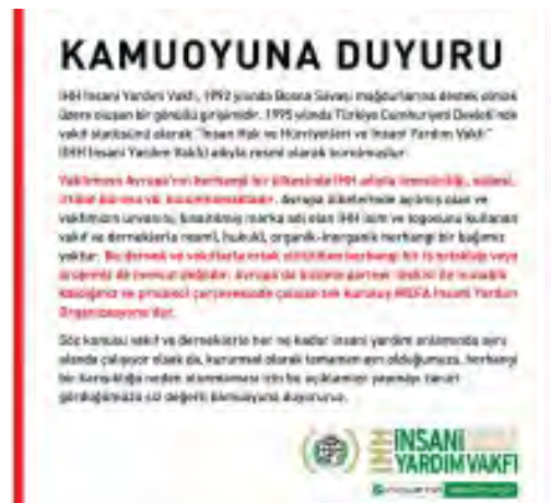
The posting on the IHH site denying links with the German organization (ihh.org.tr, July 17, 2010).

■ In response to the German foreign minister's July 12 decision to outlaw IHH in Germany because of its ties to Hamas, the organization issued a statement to the effect that IHH in Frankfurt had no connection with IHH in Turkey. According to the statement the organization was in fact established in Germany in 1992 but ceased functioning in 1996 after the Turkish IHH was set up. The organization even presented a German court decision handed down on October 17, 2008, testifying to the fact that there was no connection between the organization operating in Germany and the one in Turkey (IHH website, July 17, 2010).