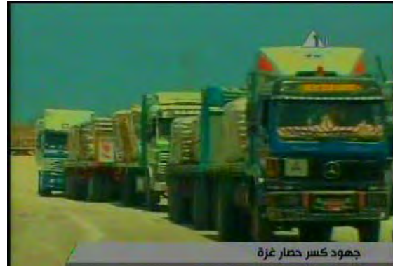
Left: Passengers from the Amalthea (Amal) at a reception with Ismail Haniya ( Hamas' Al-Aqsa TV, July 18, 2010). Right: Trucks loaded with merchandise from the Amalthea pass through the Rafah crossing into the Gaza Strip (Al-Aqsa TV, July 18, 2010).

■ Despite statements claiming the ship's documents indicated that the its original final destination was the port of El Arish (Press TV July 13, 2010; Agence France-Presse July 10, 2010), official sources in Hamas and the ship's organizers continue claiming that the original destination was the port of Gaza and that the ship changed course as a result of pressure from Israel: