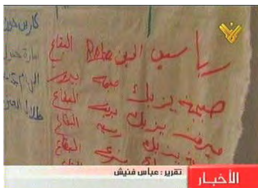
List of passengers on board the Maryam released to the media ( Al-Manar TV , June 20, 2010).

B. The Maryam – A cargo ship, it is expected to carry between 50 to 60 women from Lebanon, Japan, China, the United States, and European and Arab countries, including a number of nuns . Its cargo will contain humanitarian assistance, especially medicine. Women on board are intended to create an additional difficulty for an Israeli attempt to stop the ship.