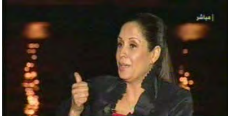
Iman Tawil Sa'ad (Al-Jazeera TV, June 19, 2010).