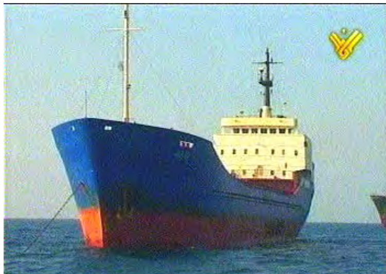
The Julia (whose name was changed to Nagi al-Ali) (Al-Manar TV, June 20, 2010).