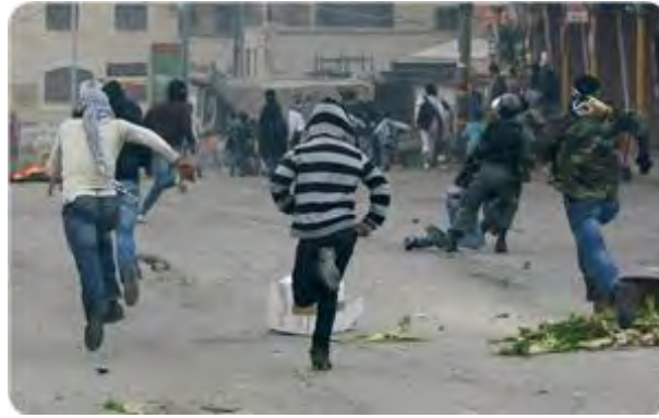
Palestinians riot in East Jerusalem (Izz al-Din al-Qassam Brigades website, March 16, 2010).