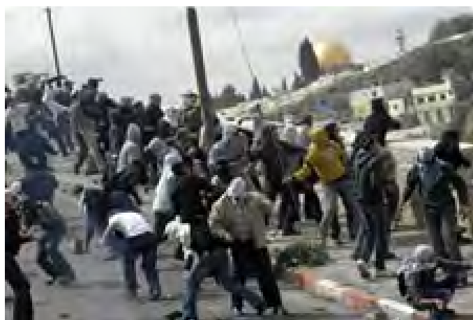
Palestinians throw stones in East Jerusalem.