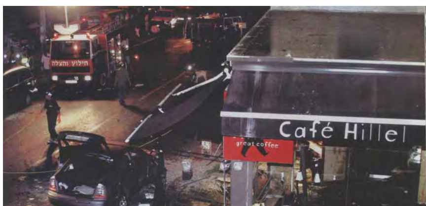
The Hillel Coffee Shop in Jerusalem, site of a suicide bombing attack (Filastin al-Muslima, October 2003).