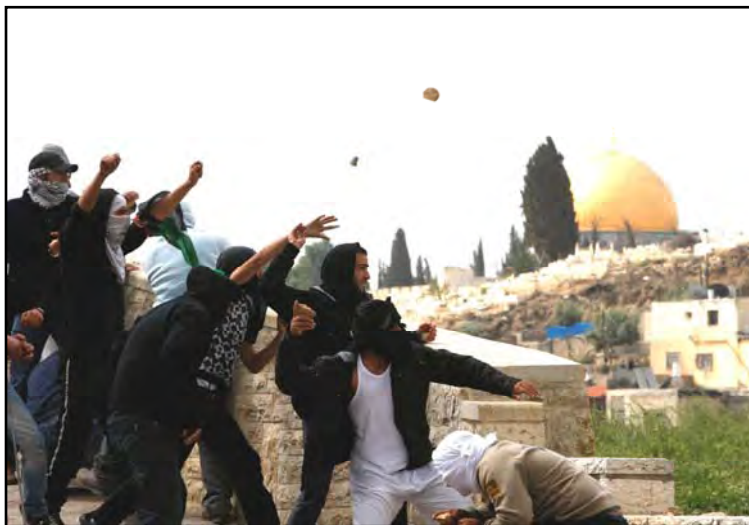
Palestinians throw stones at Israeli security forces in Wadi Joz near East Jerusalem (Baz Ratner for Reuters, March 16, 2010).