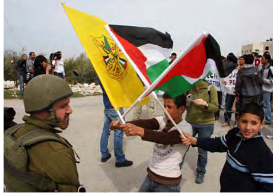
Left: women demonstrating in Sheikh Jarah. Right: Palestinian children carrying the flags of Palestine and Fatah in Bil'in (Wafa News Agency, March 3)

■ The violent demonstrations peaked on the Temple Mount (March 5), when after the Friday prayers demonstrators threw stones at Jewish worshippers at the Wailing Wall compound (for the first time in about nine years) and at police officers at the Mugrabi gate. Police forces removed the stone throwers and took over the Temple Mount compound using stun grenades. About twenty policemen were injured in the incident. According to Palestinian sources, about sixty demonstrators were injured in the incidents.