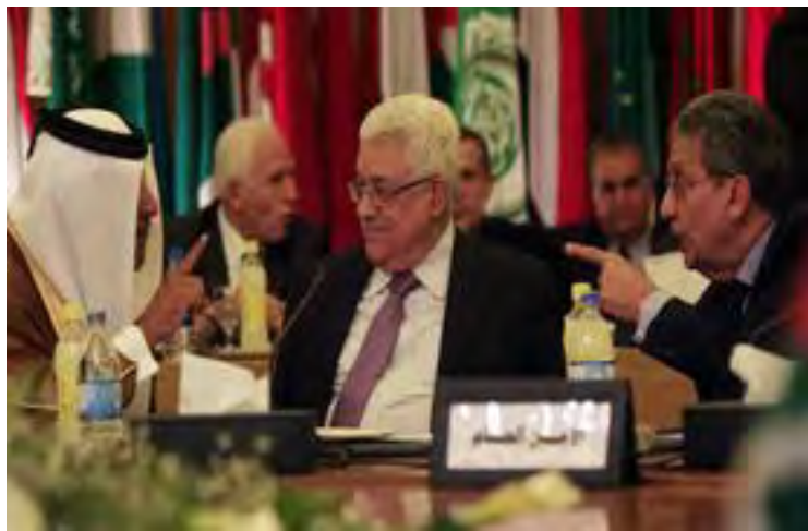
Abu Mazen at a meeting of the Arab monitoring committee, which decided to “give a chance” to the proximity talks between Israel and the Palestinians for a period of time of four months (Al-Ayyam, March 3, 2010)