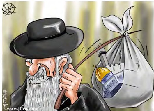
A stereotypical Jew stealing the Temple Mount, from a cartoon published in the PA daily Al-Hayat al-Jadeeda (March 3)