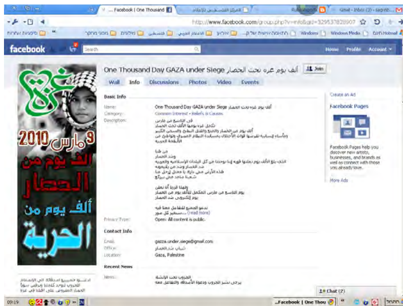
The Gaza support group on Facebook ( http://www.facebook.com/group.php?v=info&gid=329537828907 )