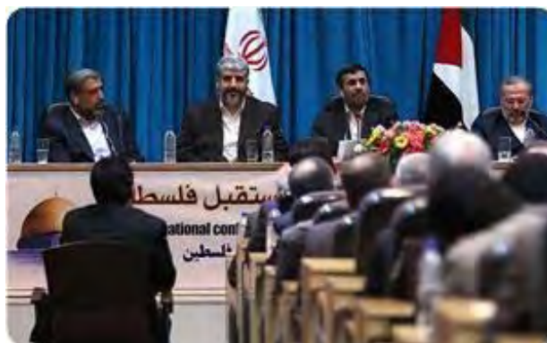
Iranian President Ahmadinejad holds a press conference with Khaled Mashaal, head of the Hamas' political bureau, at the National Islamic Solidarity Conference for the Future of Palestine (Hamas' Palestine-info website, February 28, 2010).

■ On February 28 a body calling itself the National Islamic Solidarity Conference for the Future of Palestine met in Iran. The meeting was attended by Khaled Mashaal , head of Hamas's political bureau, Ramadan Shalah , secretary general of the Palestinian Islamic Jihad, and Ahmed Jibril , head of the Popular Front/General Command. The three met with Iranian Supreme Leader Ali Khamenei . During the meeting Ahmadinejad said that "an Israeli presence, on even one inch of land in the Middle East, causes threats, crisis and war" (Agence France-Presse, February 28, 2010).