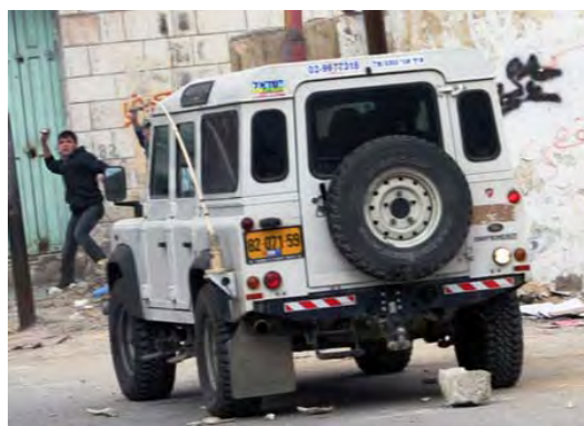
Protestor in Hebron throws rocks at an IDF vehicle.

■ This week as well there were violent demonstrations and riots following the inclusion of the Cave of the Patriarchs and Rachel's Tomb in the list of national heritage sites. Most of the riots and demonstrations took place in Hebron but there were demonstrations in a number of cities in Judea, Samaria and the Gaza Strip. The main incidents in Hebron were the following: