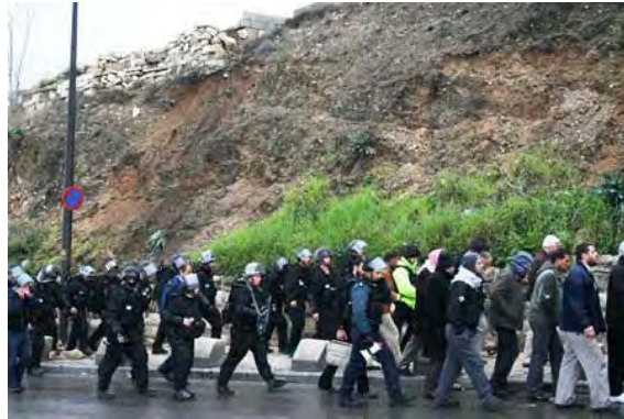
Protestors confront the Israeli police in East Jerusalem.