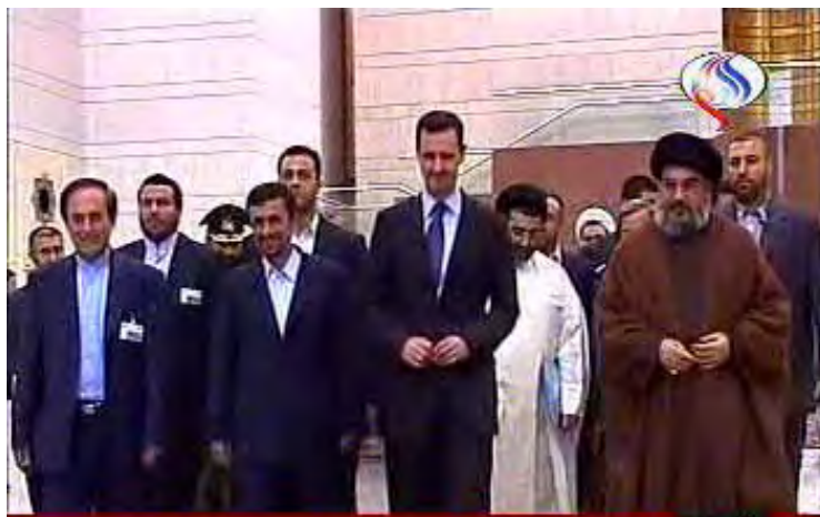
Syrian President Bashar Assad, Iranian President Mahmoud Ahmadinejad and Hezbollah General Secretary Hassan Nasrallah meet in Damascus (Al-Alam TV, February 25, 2010).