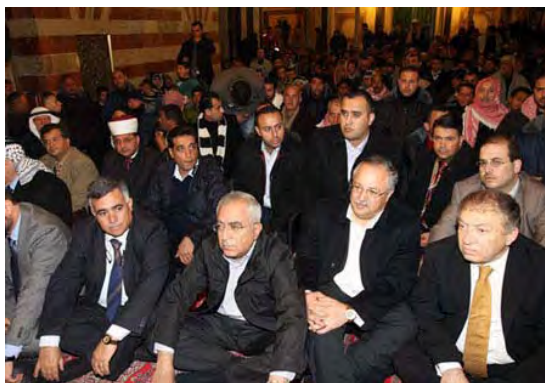
Salam Fayyad participates in the Friday prayers at the mosque in the Cave of the Patriarchs in Hebron