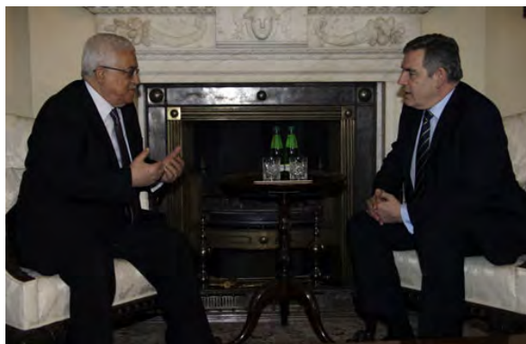
Palestinian Authority Chairman Mahmoud Abbas meets British Prime Minister Gordon Brown.

● He said he did not know why the United States had “backed off” from its demand of a total freeze in the settlements, and that he would consult with Arab allies before giving his answer to American envoy George Mitchell regarding a renewal of negotiations. He said progress would be made if Israel agreed to “the framework of a two-state solution based on the 1967 borders and an end to the occupation, with timelines [sic] and mechanisms” 5 ( Guardian , January 31, 2010).