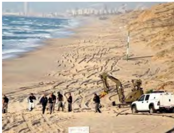
Police robot neutralizes barrel of explosives on Ashqelon beach (Photo by Edi Israel, reprinted courtesy of NRG, February 1, 2010).