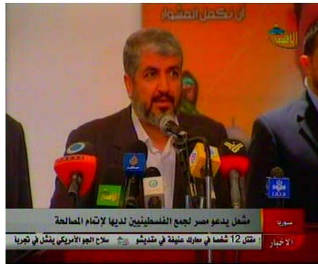
Khaled Mashaal at al-Mabhohuh's funeral in Damascus (Al-Aqsa TV, February 1, 2010).