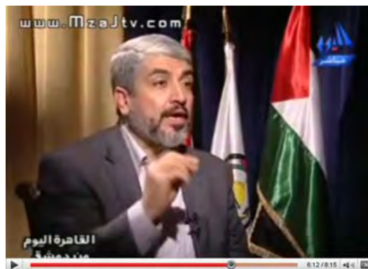
Khaled Mashaal, head of Hamas’ political bureau interviewed by Egyptian TV (Al-Yawm TV, January 26, 2010).

● Internal Palestinian reconciliation: He claimed that Hamas adhered to [the idea of] national reconciliation and expected Egypt to join it in examining its reasons for refusing to sign the Egyptian reconciliation initiative. He rejected the Palestinian Authority’s claims that Hamas refused a reconciliation, saying that “if Hamas were happy with the current situation, why would it go to Cairo for a round of talks?”