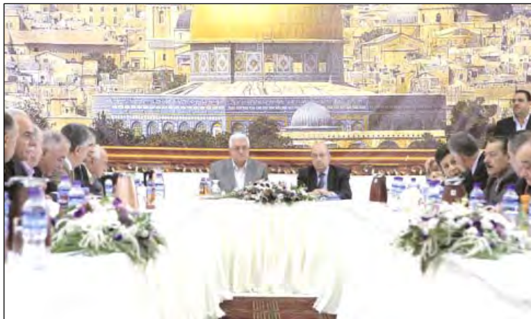
Mahmoud Abbas declares elections to be held on January 24, 2009 (Al-Hayat Al-Jadeeda website, October 24, 2009).