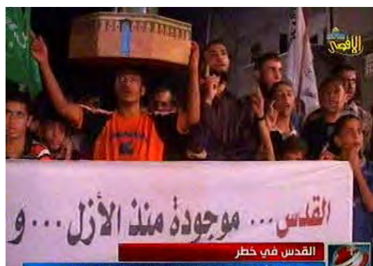
Demonstration organized by Hamas in Rafah, broadcast by Al-Aqsa TV as "Jerusalem in danger" (October 26, 2009).