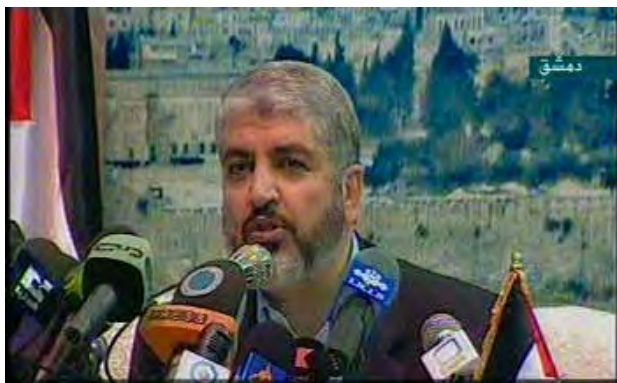
Khaled Mashaal holds a press conference in Damascus (Al-Jazeera TV, October 25, 2009).

■ After a conference of Palestinian terrorist organizations in Damascus, Khaled Mashaal , head of the Hamas political bureau, told a press conference that the edict was neither legitimate nor legal. He claimed it would widen the internal Palestinian schism and that elections would be held only after a reconciliation had been reached (Hamas' Palestine-Info website, October 24, 2009).