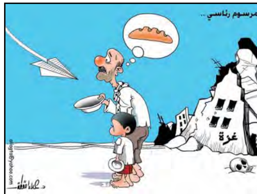
In the ruined Gaza Strip Palestinians ask for bread and receive a presidential edict from Mahmoud Abbas (Hamas' Felesteen, October 25, 2009).

■ Behind Mahmoud Abbas' edict was the Hamas statement of October 16 regarding its rejection of the Egyptian reconciliation agreement, which was supposed to have been signed on October 26. In practical terms , the Palestinian Authority cannot hold free elections in the Gaza Strip in view of Hamas' opposition and control. In political terms , the edict can be seen as an attempt to exert pressure on Hamas by representing it as sabotaging the Egyptian reconciliation efforts and fearing elections. In any event, Mahmoud Abbas left a window open for changing the date noted in the edict according to progress made by Egyptian attempts at negotiation.