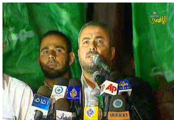
Ismail Radwan speaking at the protest rally (Al-Aqsa TV, October 25, 2009).

● Ismail Radwan , Hamas spokesman in the Palestinian Legislative Council, speaking at a protest rally, denounced Israel and accused the Palestinian Authority of collaborating with it. He said that Jerusalem and the Palestinian territories would only be liberated by the so-called "resistance" [i.e., terrorism and violence], and called on the Palestinians to use every means at their disposal to defend Al-Aqsa mosque (Al-Aqsa TV, October 25, 2009).