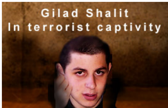
June 25, 2009: Three years since the abduction of Gilad Shalit (Israeli Foreign Ministry website, June 29, 2009).