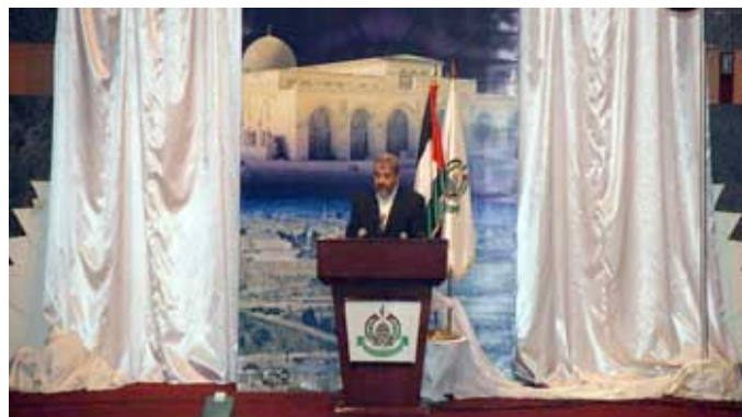
Khaled Mashaal delivers his speech.

■ On June 26 Khaled Mashaal, chairman of Hamas's political bureau in Damascus, delivered a speech containing Hamas's position on a number of political issues. It was not particularly inflamed but it also did not exhibit the smiling face Hamas has recently shown.