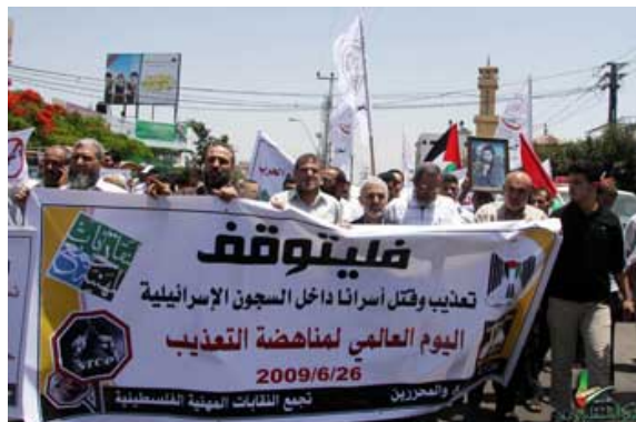
The Gaza Strip marks the third anniversary of the abduction of Gilad Shalit (Hamas's Palestine-Info website, June 29, 2009).

● The ministry of prisoners' affairs in the Hamas de-facto administration officially announced that it demanded the media stop speculating about prisoner exchanges which, it claimed, was having a negative influence on the morale of Palestinian prisoners in Israeli jails and on their families (Qudsnet website, June 28, 2009). Hundreds of family members of Palestinians in Israeli jails held a demonstration at the Erez crossing, calling for the lifting of the closure of the Gaza Strip and the release of Gilad Shalit only in return for the release of all the Palestinian prisoners incarcerated in Israel (Agence France Presse, June 24, 2009).