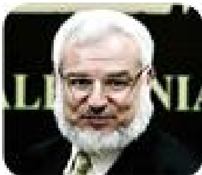
Aziz Dweik, Hamas activist and chairman of the Palestinian Legislative Council, released from custody (Hamas's Palestine-Info website, June 29, 2009).

■ On June 23 Israel released Hamas activist Aziz Dweik, former chairman of the Palestinian Legislative Council. He served a three-year term and a military court refused to extend his imprisonment. Dweik was detained in August 2006 by the IDF forces in Ramallah. In December 2008 he was convicted of membership in a terrorist organization and sentenced to three years imprisonment. He will apparently return to his post as Council chairman ( Al-Quds TV , June 23, 2009). The Hamas faction in the Council held a meeting headed by Ismail Haniya, and one of the topics discussed was ways to reactivate the Council in Judea and Samaria ( Al-Bayan Center website , June 29, 2009).