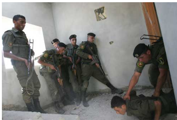
The Palestinian Authority's national security force trains in the Jenin and Tubas districts (Wafa News Agency, June 23, 2009).