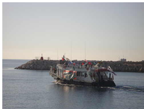
Left: The Spirit of Humanity. Right: The ship sails from Larnaca (Free Gaza website, June 29, 2009).

■ The American branch of Viva Palestine issued an invitation via its website for people wanting to join the organization's humanitarian assistance convoy, which will leave New York at the beginning of July and enter the Gaza Strip via Egypt. A similar convoy will leave Britain (Viva Palestine website, June 24).