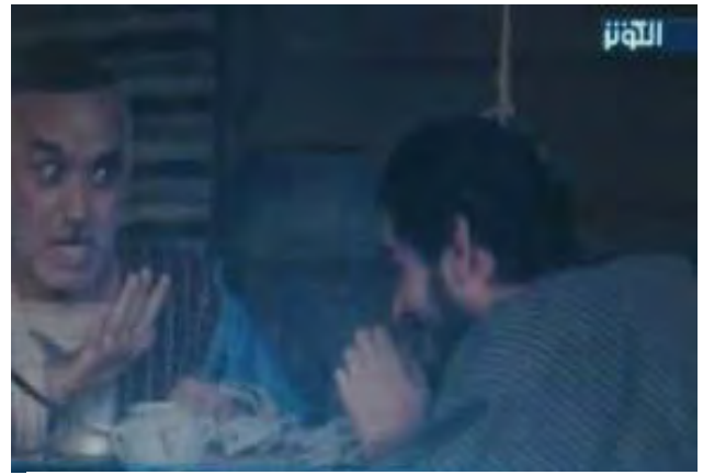
Jews in the series: Jews counterfeit coins to build the next Temple.