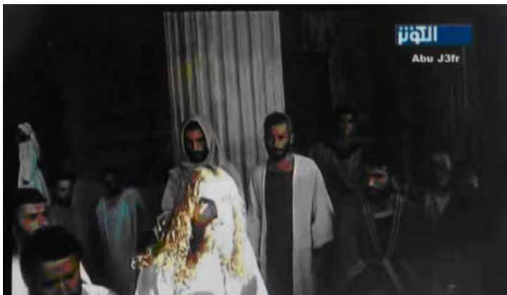
Jesus calls the Jewish priests "sons of snakes" several times (the snake is a familiar anti-Semitic motif).