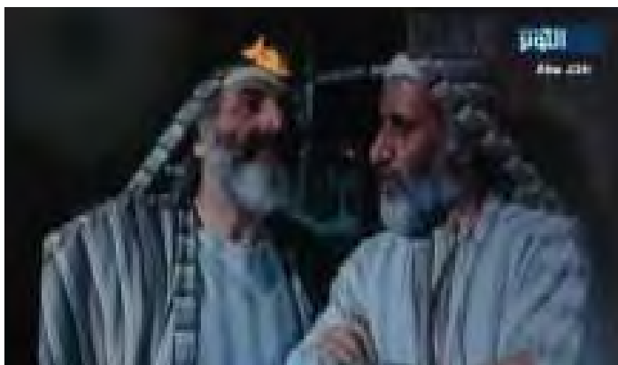
The Jews are worried by Jesus' success, and one says, "This may destroy our profits."