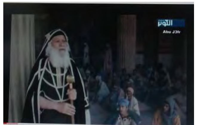
A priest says the Israelites have sunk to the depths.