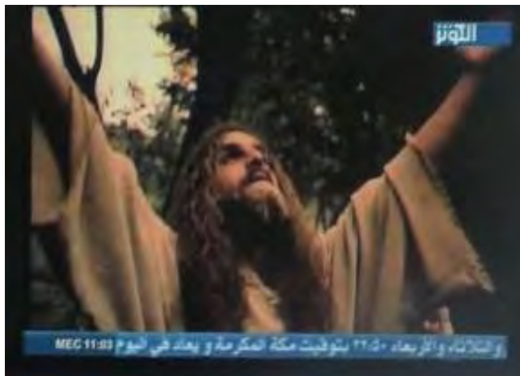
The figure of Jesus in the series

A. In the first episode Satan appears before Jesus and tries to keep Him from fulfilling His mission as prophet. He tells Jesus that He is the son of God, but Jesus "passes the test" and does not accept what Satan says.