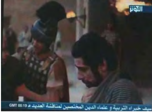
Jews in the series: A Jew informs on plotters against the Roman authorities