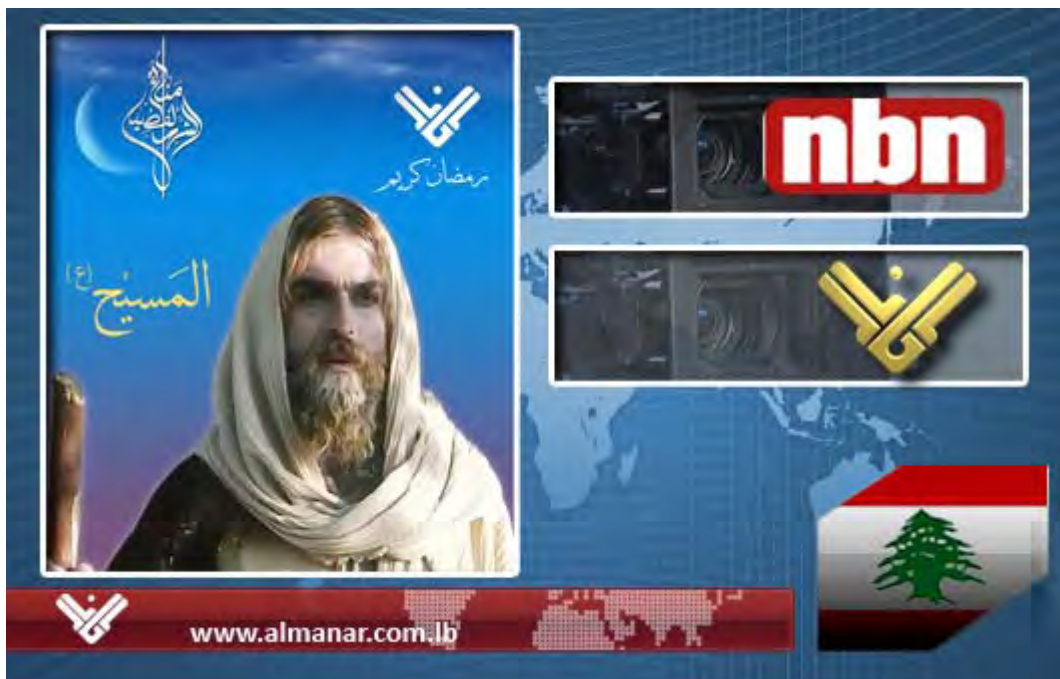
The Iranian series "The Christ," broadcast by Hezbollah's Al-Manar TV and the Lebanese Shi'ite channel NBN-TV, affiliated with the Amal movement.

For the Muslim holy month of Ramadan, Hezbollah's Al-Manar TV and the Shi'ite Amal NBN-TV broadcast "The Christ," an Iranian-produced series rife with anti-Christian anti-Semitic expressions. The Lebanese Christians protested the program's airing and it was taken off the air.