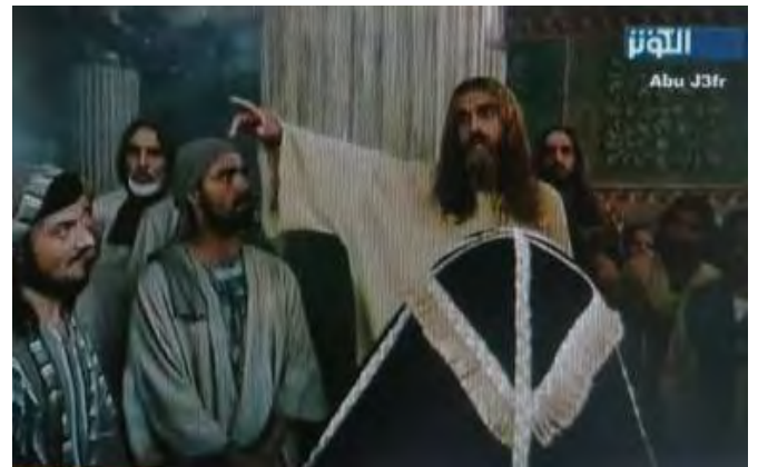
Jesus again calls the Jews "sons of snakes."