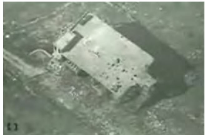
The explosion at the arms cache in Khirbet Silim (July 14, 2009)