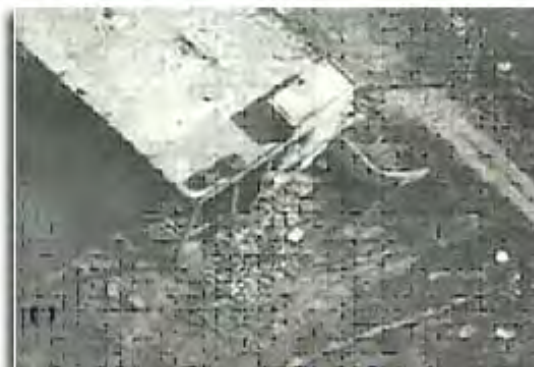
Aerial photo of the building in Khirbet Silim after the explosion

12. The explosion of the arms cache in the village of Tair Filsay was the second incident of its kind in the past three months. In both instances Hezbollah destroyed the evidence and transferred the materiel to other sites before it allowed UNIFIL and Lebanese army forces to enter the area. In both instances Hezbollah tried to make Israel seem responsible. In both instances the Lebanese army announced its intention to “investigate,” investigations which in our assessment will not incriminate Hezbollah.