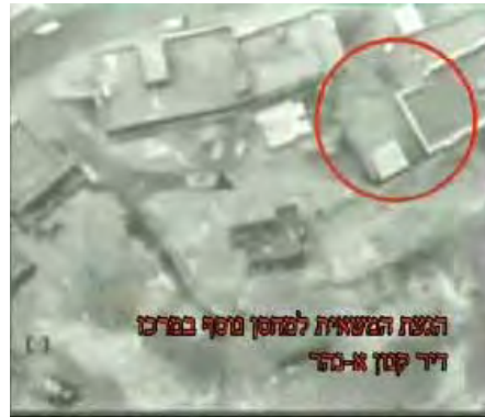
Left: The trucks arrive at an alternative weapons cache, this one in Dir Qanoun al-Nahar. Right: Two hours and 45 minutes later, Lebanese army forces are allowed into Tair Filsay.

Note: The Lebanese army and UNIFIL forces were only allowed into Khirbet Silim the day after the explosion, where they found the arms cache abandoned but with the remaining weapons the organization had not had the time to move. The weapons were apparently moved to the village of Bir al-Sanasil, about half a kilometer southwest of Khirbet Silim. A clash developed with UNIFIL soldiers who wanted to search the village for the weapons on July 18, 2009.