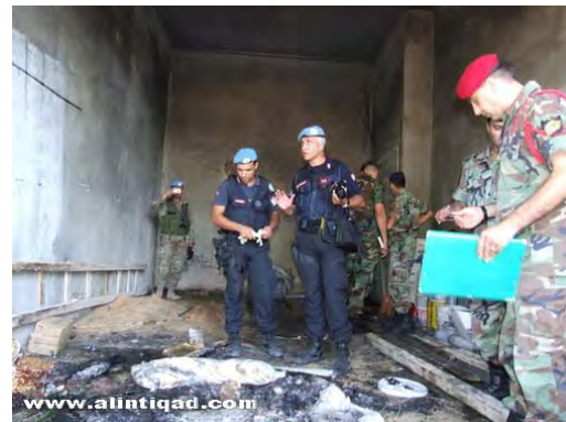
UNIFIL forces examine the exterior and interior of the explosion site (Hezbollah's Al-Intiqad website, October 13, 2009).

2. As in the past, Hezbollah was quick to contain the event and cover up the evidence proving it maintained an arms cache in a civilian area and thus violated UN Security Council Resolution 1701. Immediately after the explosion, Hezbollah operatives closed the area to UNIFIL and Lebanese army forces and using large trucks, began transferring the remaining weapons to an arms cache in the center of the village of Dir Qanoun al-Nahar , about three