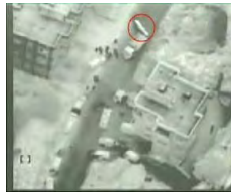
Left: Operatives and trucks gather at the building and begin loading the remaining weapons on trucks. Right: Loading a rocket, clearly seen on the truck.

Note: After the explosion at the arms cache in the village of Khirbet Silim Hezbollah also contained the event, sending dozens of operatives to the site. 2