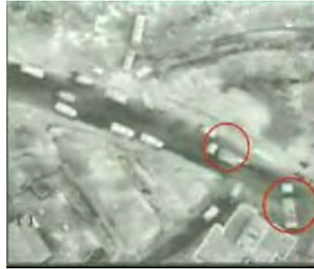
Left: Trucks loaded with weapons and camouflaged. Right: The trucks leave Tair Filsay en route to an alternative weapons cache.

Note: Two trucks also arrived at the site of the explosion in Khirbet Silim to evacuate the remaining arms, particularly rockets and mortar shells.