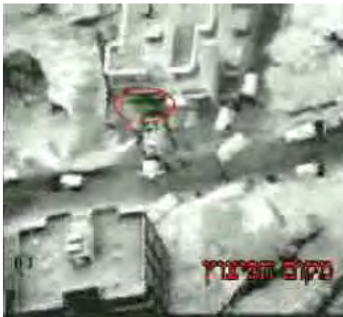
]The explosion at the arms cache in Tair Filsay (October 12, 2009).

Explosions at two Hezbollah arms caches in villages in south Lebanon