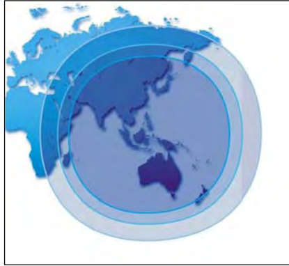
Range of the satellite's transmissions (From the company website)

8. In the past the Jewish community in Australia protested Al-Manar TV's incitement hate propaganda broadcasts, which reached the country via IndoSat. However, the Australian government, apparently both unable and unwilling, took no steps to curtail reception of Al-Manar TV broadcasts.