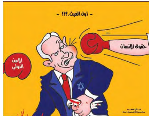
Netanyahu receives a knock-out punch, called "rain after a drought." The arm on the right reads "Human Rights" (Jordanian newspaper Al-Sabil Al-Islami, October 17, 2009).