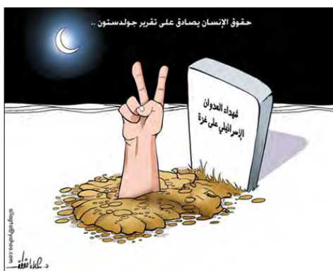
The title reads “Human rights [organization] accepts Goldstone Report.” The headstone commemorates those killed during Operation Cast Lead (Hamas’ Felesteen, October 18, 2009).

9. Hamas senior figures praised the vote and continued attacking Mahmoud Abbas. Hamas spokesmen claimed that the Goldstone Report did not relate to Hamas at all but rather to all the Palestinian armed groups. 2 Hamas also denied Israel’s accusations of its use of civilians as human shields. The movement heads have also promised to appoint an investigatory committee , as instructed by the Report, to examine Hamas’ conduct.