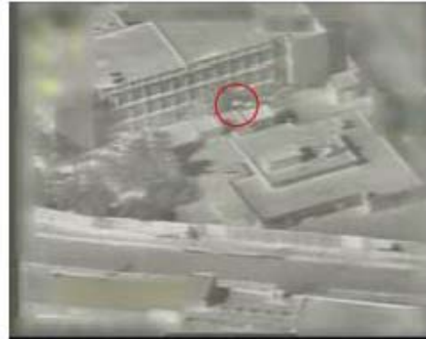
Rocket launching squad positioned near the main building of an UNRWA educational complex in Beit Hanoun (Photographed by the Israeli Air Force and issued by the IDF Spokesman, October 31, 2007).