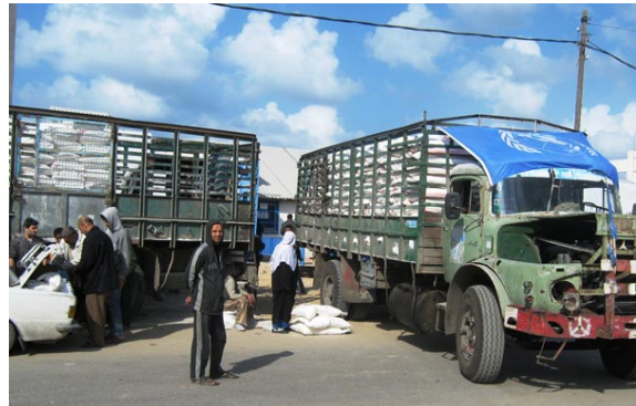
UNRWA supply trucks in the Gaza Strip