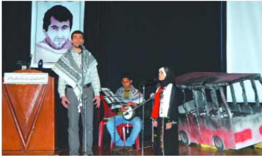
The performance of the Al-Aqsa Hawks, with a miniature model of a burned down bus and a photograph of Yahya Ayyash in the background