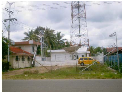
SATELINDO's ground satellite station