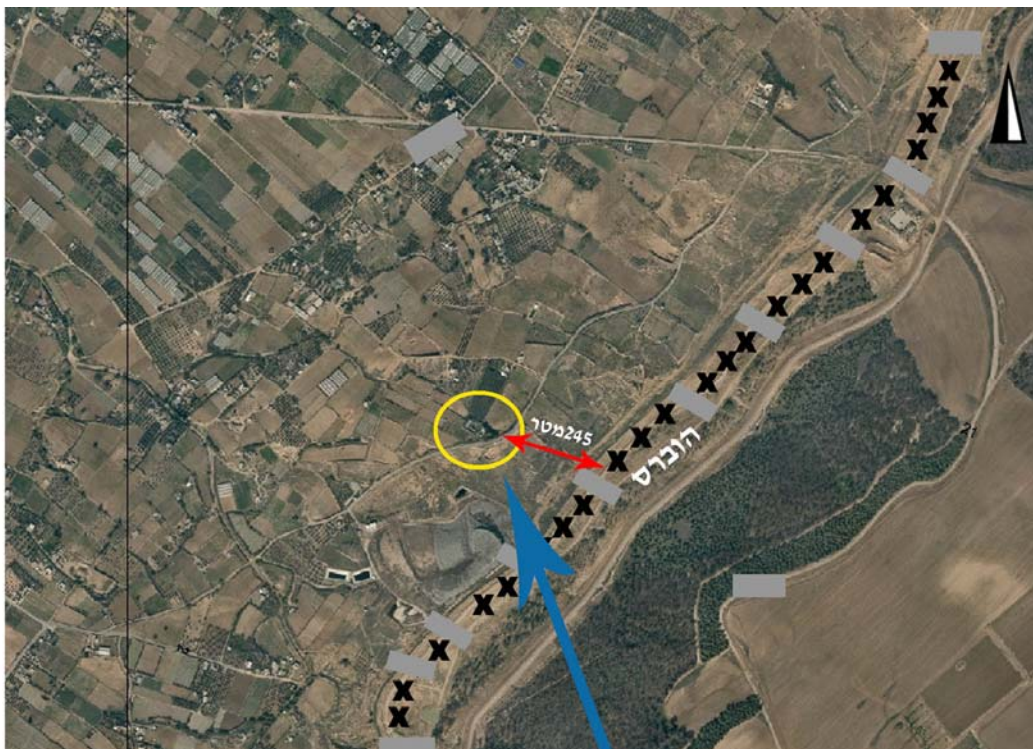
Aerial photo of the region where the IDF forces operated. It shows the distance (245 meters, less than 2/10 of a mile) between the opening of the tunnel and the Israel border. The tunnel was planned to be used for the abduction of Israeli soldiers (Photo courtesy of the IDF Spokesman, November 5).

Escalation in the Gaza Strip: the IDF operated inside the Gaza Strip near the security fence to prevent the abduction of soldiers. In response several dozen rockets and mortar shells were fired. Spokesmen for Hamas condemned Israel but did not announce its cancellation of the lull arrangement.