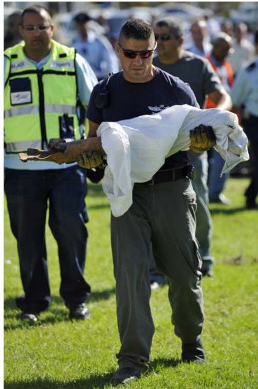
Police explosives expert carrying the remains of a rocket fired at Ashqelon (Amir Cohen for Reuters, November 5).

and on in the center of a residential neighborhood. Three women were treated for shock. One rocket fell on the greenhouses of an Israeli village, causing property damage. The Israeli Air Force attacked several squads firing rockets and mortar shells in the Khan Yunis region. The rocket and mortar fire ended around noon on November 5.