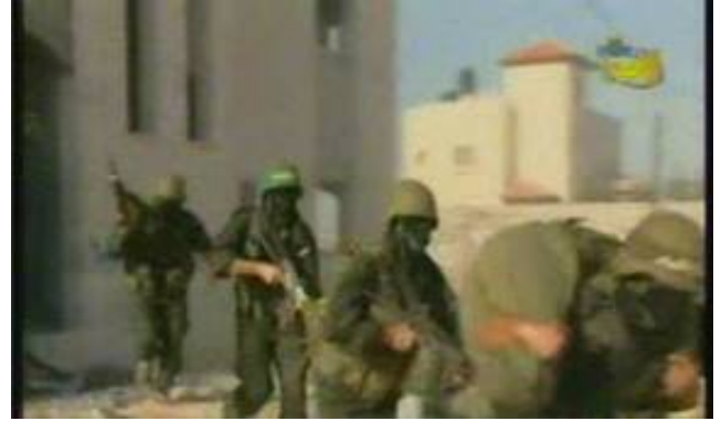
Hamas/Izz al-Din al-Qassam Brigades operatives undergoing military training at the Nuseirat refugee camp (Al-Aqsa TV, October 30).