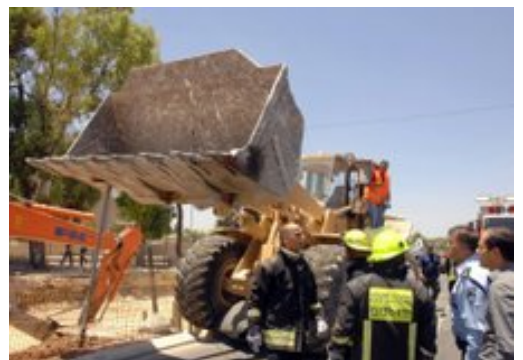
The construction vehicle used in the mass-casualty attack in Jerusalem on July 2.