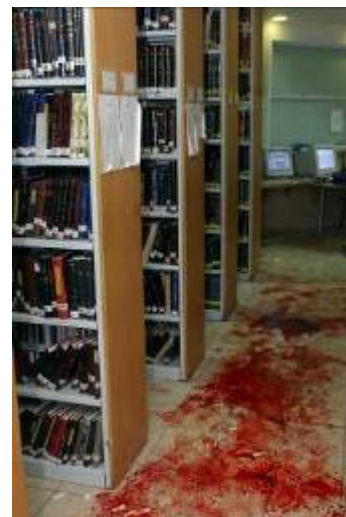
The scene of the terrorist attack at Mercaz Harav Yeshiva (March 6).

Eight yeshiva students were killed and 10 wounded, four of them critically. The terrorist was Ala'a Hashem Abu Adhim , a resident of Jabel Mukaber, southeast of Jerusalem. 2