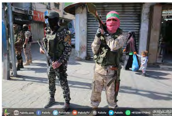
Right: Extensive deployment of armed Hamas operatives throughout the Gaza Strip