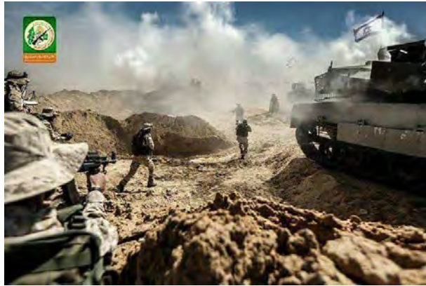
Storming IDF tanks