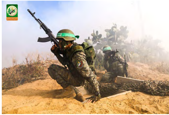
Emerging from a tunnel opening