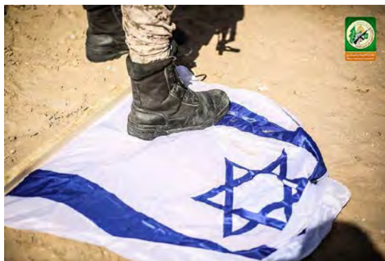
Stepping on an Israeli flag (PalInfo's Twitter account, March 25, 2018)