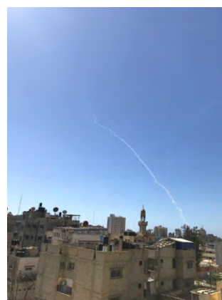
Firing rockets at the Mediterranean from a populated area in the Gaza Strip