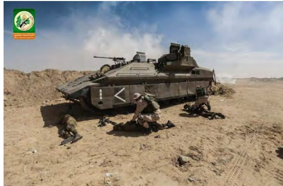
Right: Abducting soldiers from tanks. Left: Escaping from a tank with abducted soldiers (PalInfo's Twitter account, March 25, 2018)