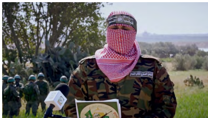
Abu Obeida, spokesman for the military wing of Hamas, delivering a speech summing up Hamas’s military maneuver in the Gaza Strip