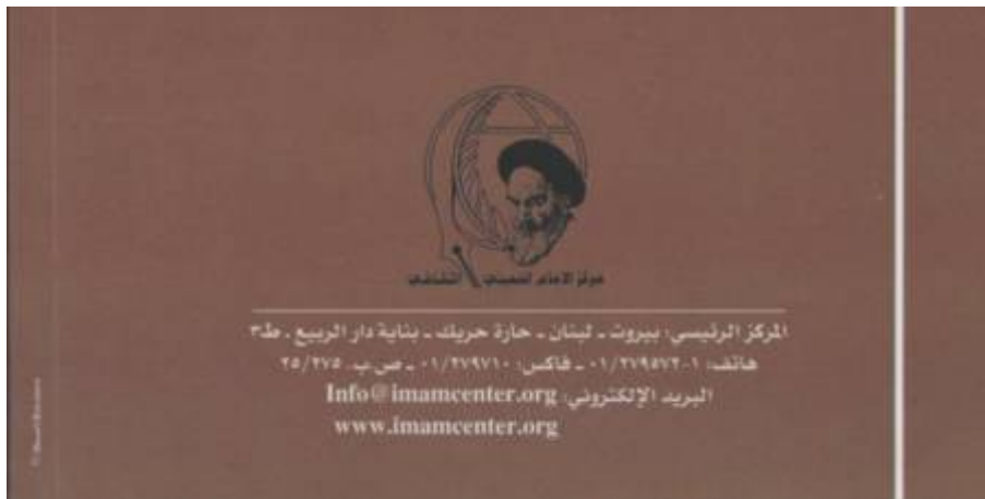
The address of the Imam Khomeini Culture Center in Harat Hreik, southern Beirut (the back cover of the booklet)