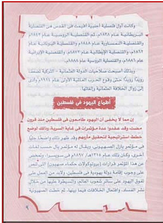
The Protocols of the Elders of Zion – the alleged origin of the resolutions to found a Jewish state in Palestine and establish Jewish control over the world's nations (p. 9)