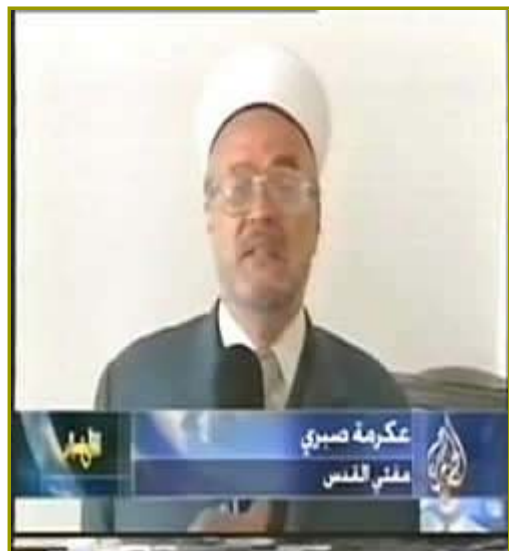
Sheikh Ikrima Sabri

Date of publishing : August 2002 (1 st edition).